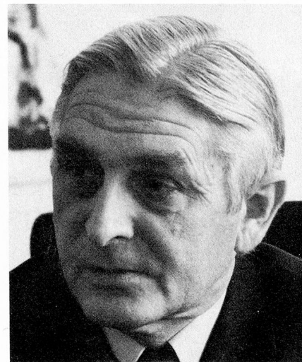
The former Federal Councillor Ernst Brugger, President of the Commission since 1979