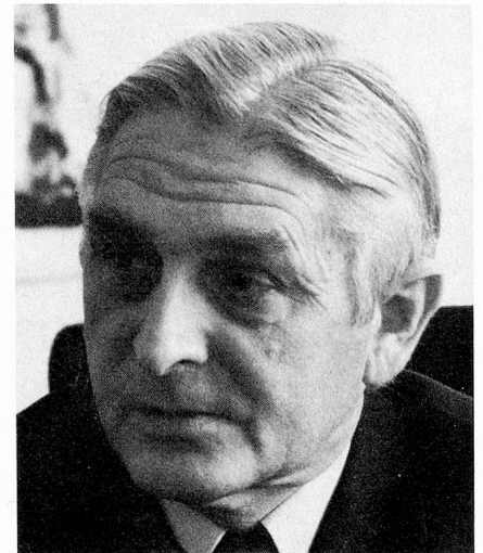
The former Federal Councillor Ernst Brugger, President of the Commission since 1979