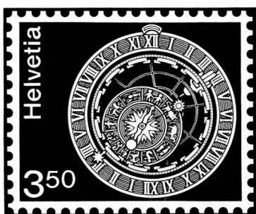
Astronomical clock of Berne clock tower