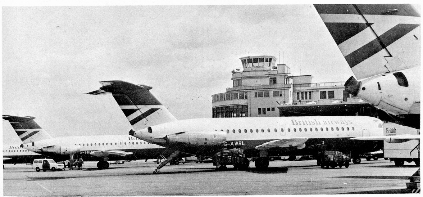
British Airways aircraft at Birmingham Airport.

N.B. All fares are correct at time of going to press but maybe subject to amendment.