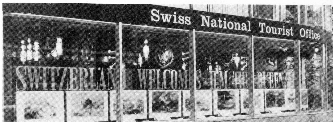
This is how the London office of the SNTO marked the royal tour

THE hills and dark forests of the Jura tempt the holidaymaker to take a break from the daily round. One way to see the romantic Ajoie region, the Alsace and the Laufen Valley or the Franches Montagnes at a comfortably slow pace is to explore it by gipsy caravan. The tours last seven or eight days and are available until October.