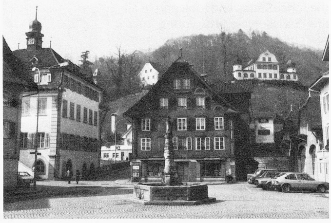
A square in the old Sarnen; on the left the town hall; the old shooting stand on the Landenberg hill (Photo Rheinhard).