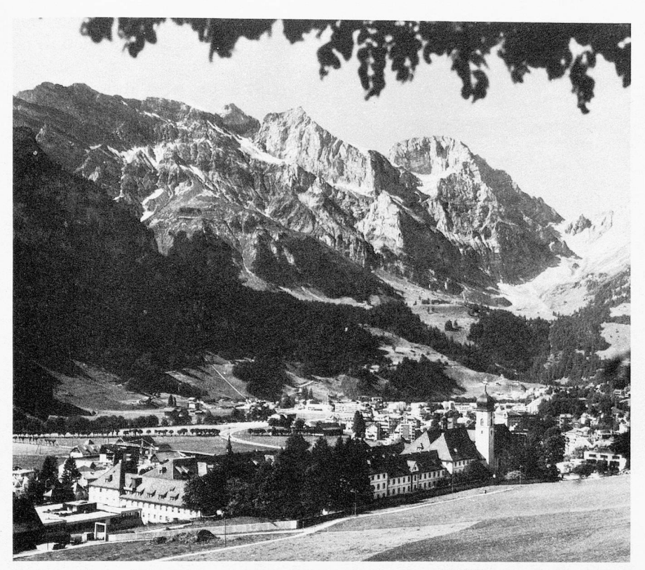
The Benedictine Abbey of Engelberg, founded in 1120 (Photo ONST).

View of Sachseln and the lake of Sarnen (Photo ONST)