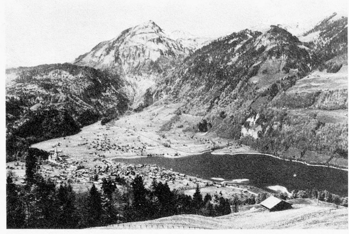
Lungern and its lake