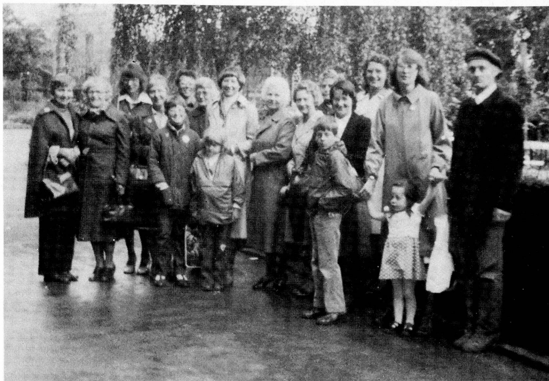
Damp but not dispirited at Bristol Zoo

costumes of Evolène in the Val d'Hérens sang with grace and charm and most efficiently and were enthusiastically applauded by the large audience.