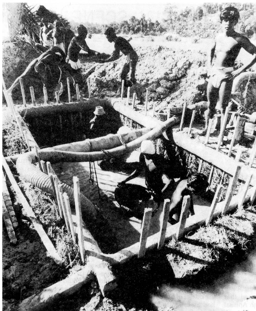
Villagers dig a well to tap a vital need in Sri Lanka — water. Swiss experts are helping to provide wells in remote parts of the island.

But now their whole life style has changed. They have their own gardens, where they are growing fruit and vegetables. They have schools and nurseries, for which Terre des