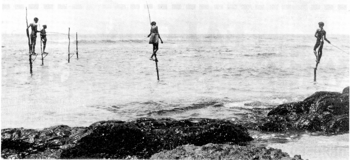
Perched patiently on their poles . . . the fishermen of Sri Lanka

to want to turn their eyes away from the appalling conditions in which most of their own workers are forced to live.