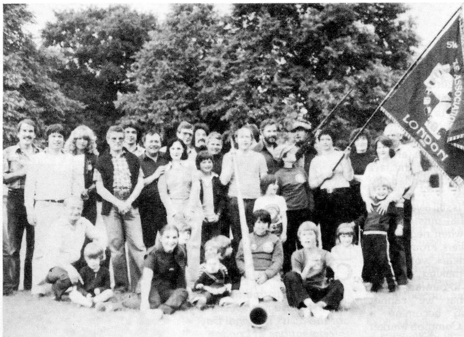
Members of the Swiss Rifle Association and friends at Bisley after their mid-summer rifle meeting and barbecue. Four members appeared on ITV's World of Sport programme recently demonstrating their skill at 300m. The Association's activities resume on September 7 at Bisley. New members are welcome — contact the secretary, 58 Dickens Rise, Chigwell, Essex, for details.