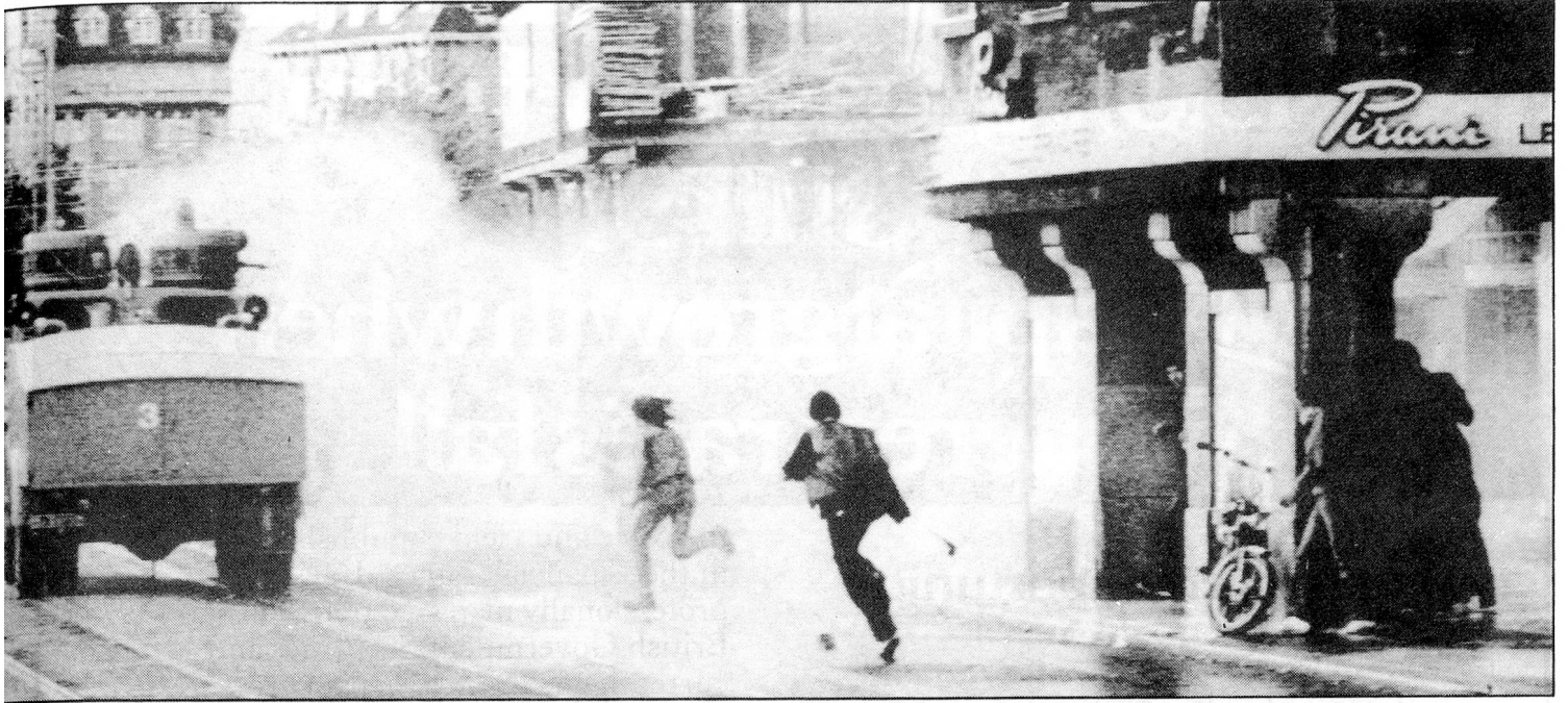
Police water cannon on the Limmatquai