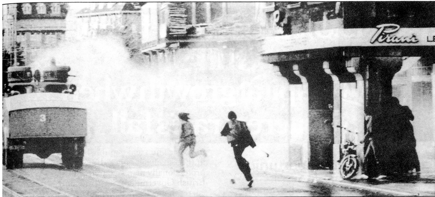
Police water cannon on the Limmatquai