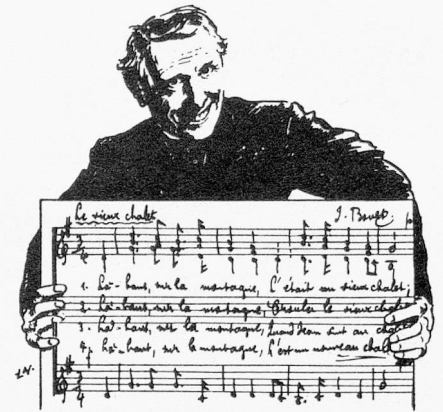
Abbé Joseph Bovet 1879-1951

Saturday, 23rd and Sunday, 24th August: Day of the Fribourgeois from inside Switzerland and abroad at «Grün 80», Swiss exhibition on horticulture and landscaping, covering 46 ha.