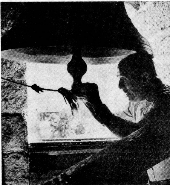
Prelude to melody . . . the bell rope is attached.

Ernen can be reached by car when driving from Brig along the Goms Valley towards the Furka Pass. Those travelling on the Glacier Express can get off at Fiesch and take the post coach to Ernen.