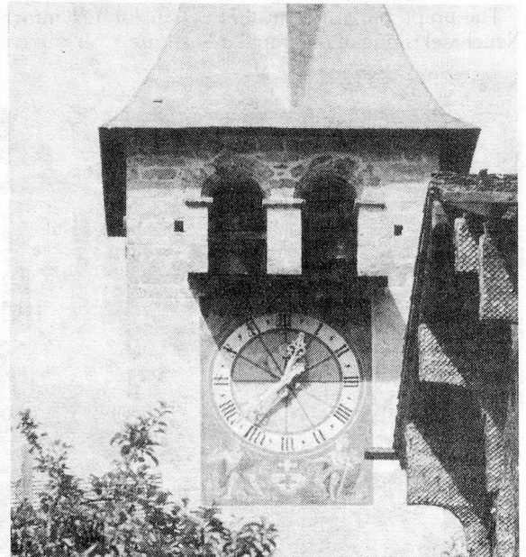
The large clock face of the Church of St. George carries heraldic figures from Ernen's historic families.