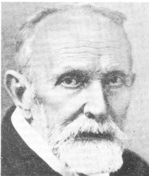
Carl Spitteler, the poet (1845-1924)