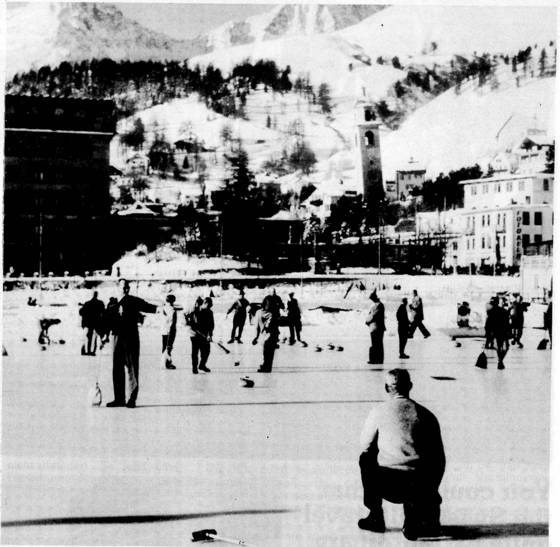
Curling at St. Moritz

They flew to London at the invitation of the Swiss National Tourist Office, Swissair and the Daily Mail Ski Show. During their short stay they also visited the House of Lords.