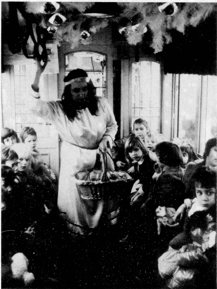
The Christmas Fairy offers "Willisauerringli"

The dual aspect of the custom comes particularly to the fore in Central Switzerland, where it has become traditional to mark the period before Christmas with big, noisy processions.