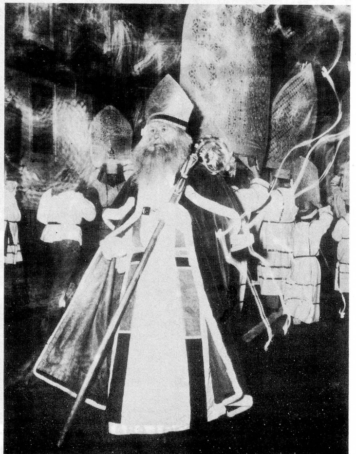
Colourful dancers accompany St. Nicholas