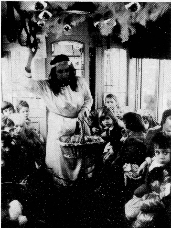
The Christmas Fairy offers "Willisauerringli"

The dual aspect of the custom comes particularly to the fore in Central Switzerland, where it has become traditional to mark the period before Christmas with big, noisy processions.