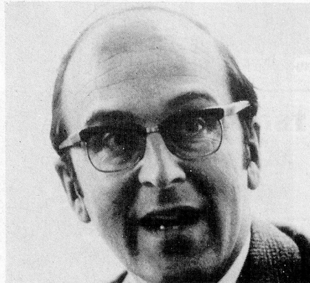
Justice Minister Mr Kurt Furgler is the new Swiss President

usually remain in office until they say they want to resign.