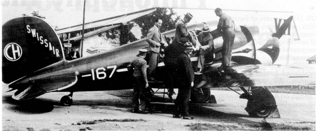
Loading a Lockheed-Orion in 1932. It carried four passengers plus the pilot.

At the beginning of July the former chief flying instructor of the Swiss Air Force, Lieutenant Oskar Bider, formed a "committee to promote a Swiss company for air tourism" which led on September 20 to the foundation in Zurich of Frick & Co. On December 15 this third company became the Ad Astra Swiss Air