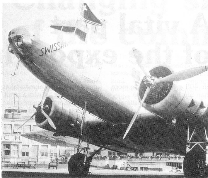
The imposing DC-2 at Zurich in 1932 before a flight to London. The flag told the control tower the plane was ready to take off.

On the outbreak of war in 1939 Swissair had to suspend regular services for almost six years. But it was back in business on July 30, 1945, and enlarged the fleet by the acquisition of several DC-3s. In the following year it ordered four Douglas DC-4s, its first