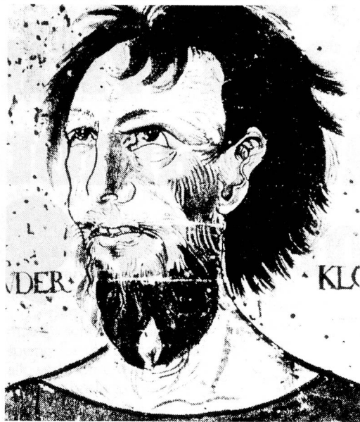
The oldest known picture of Brother Klaus, circa 1500

In his collected works I found a study in which he writes: "Medically I can find nothing wrong with Brother Klaus. I see him as a somewhat unusual, but in no way pathological person, a man after my own heart, my brother Klaus. Rather remote, to be sure, at this distance of more than 400 years, separated by culture and creed, by those