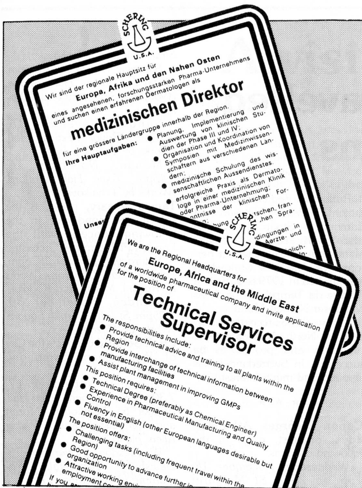
Typical forms of advertising for Swiss executives – these appeared in the USA.

“stagiaire” permits – for student trainees – gave a good chance for a limited stay abroad, and bilateral agreements existed with several countries for education and training, often resulting in permanent residence. Such permits are now available for the USA, where they did not exist previously.