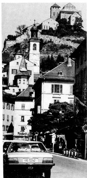
"Tous Vents" sector of old Sion seen from the Rue de Lausanne with the Collegiate Church and Valère

From Valère the eye sweeps over a sunlit countryside