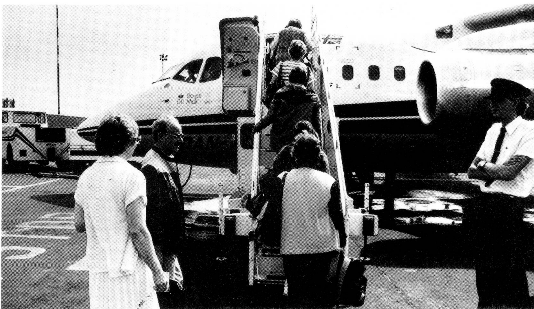
All aboard for Berne! British holidaymakers and businessmen bound for Switzerland go aboard the new Dan-Air 146-100 jetliner.