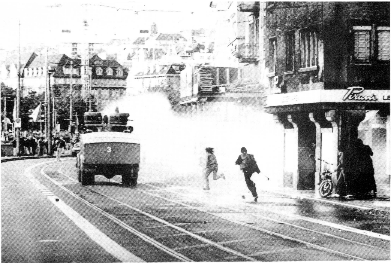
Flashback to 1980: violence in the streets of Zurich

misunderstood youth and talking like “old adolescents” fashionably siding with youth dissenters and taking a bash at the society which afforded them a comfortable existence.