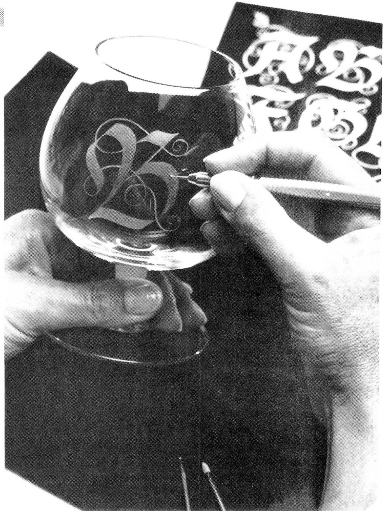
The delicate art of etching on glass

GLASS engraving, once the privilege of a few masters, can today be practised by people of every age and profession, even without any artistic talent or experience, thanks to a surprising new and easy technique developed in Switzerland by a group of enthusiasts some years ago.