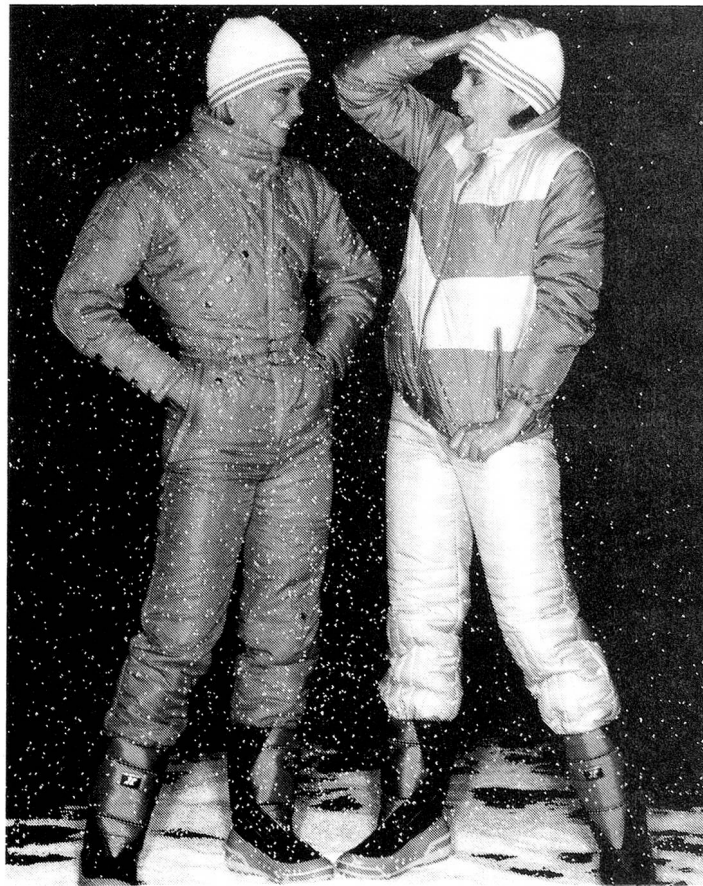
Strong vibrant colour is a must, and these outfits come in kingfisher, fuchsia and silver. On the left, a comfortable and flattering one-piece with extended shoulders and plenty of fashionable stitching and press studs. On the right, a chevron stripe jacket with zip-out sleeves worn with warm salopettes.

If you are going ski-ing this winter, then there really is no excuse for wandering around the slopes like the Abominable Snowman.