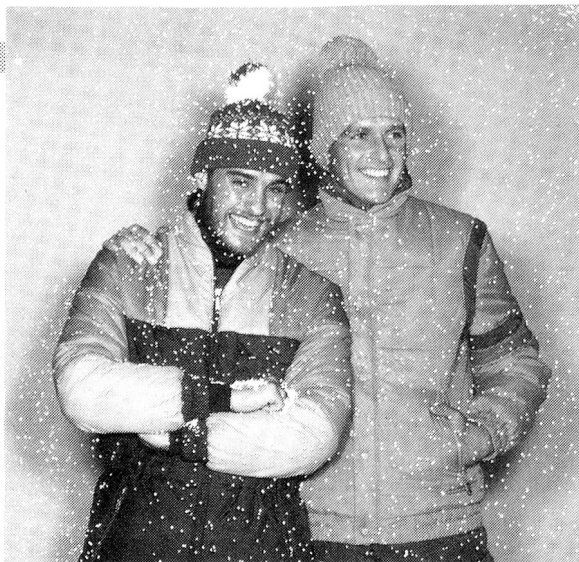
Two outfits for the man in your life. The one-piece has deep pockets and elasticated waist and cuffs; while the quilted jacket has zip out sleeves, and colour co-ordinates with the salopettes.

Here in the guest house I can often welcome the Swiss from home (Switzerland) and since my father came to live with me, recently a widower at 84, we have visitors very often, both as private and official guests. Our young Swiss mother has managed (though having an English husband) to teach her children Swiss German. So we feel we are creating our Swiss colony abroad!