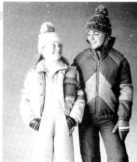
These two would certainly not be missed on the slopes. The girl's outfit is a snug all-in-one with matching gilet, and the boy's is a chevron stripe jacket with matching salopettes.