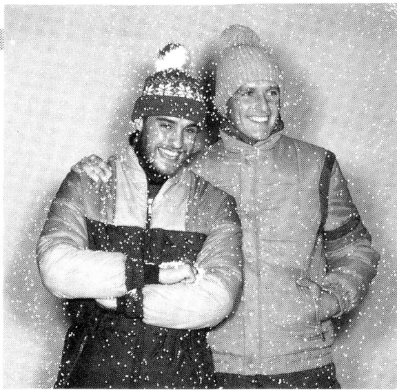
Two outfits for the man in your life. The one-piece has deep pockets and elasticated waist and cuffs; while the quilted jacket has zip out sleeves, and colour co-ordinates with the salopettes.

Here in the guest house I can often welcome the Swiss from home (Switzerland) and since my father came to live with me, recently a widower at 84, we have visitors very often, both as private and official guests. Our young Swiss mother has managed (though having an English husband) to teach her children Swiss German. So we feel we are creating our Swiss colony abroad!