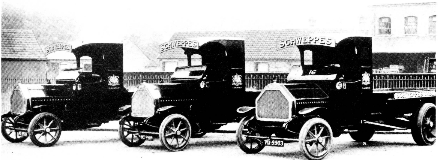
A Schweppes fleet of Swiss "Berna" trucks in London, 1915