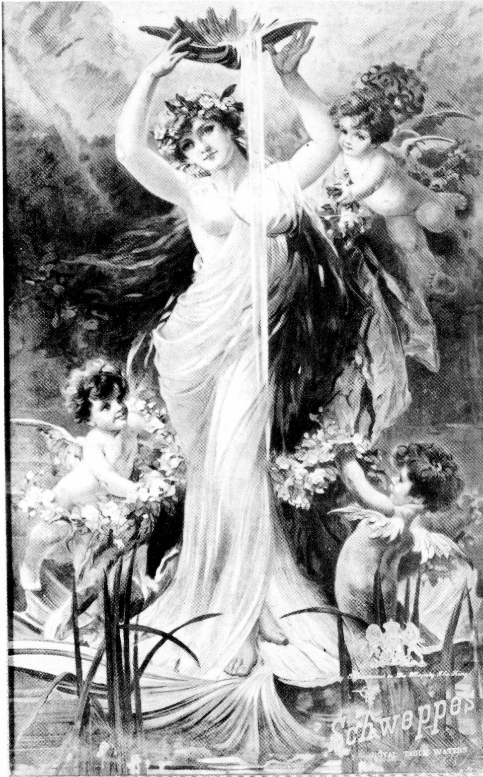
This advertisement for Schweppes "Royal Table Waters" about 1900 captures the essence of the turn-of-the century ideal of feminine beauty