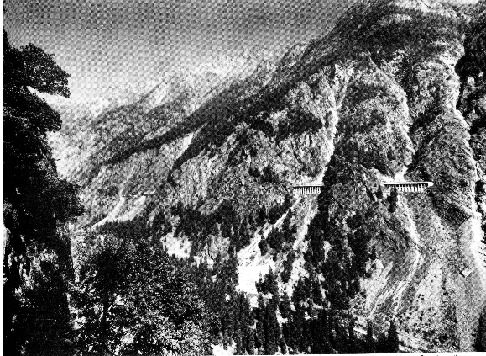
Avalanche galleries protect the Berne – Loetschberg – Simplon railway.

federation, but specific research is undertaken for private bodies paid for individually.