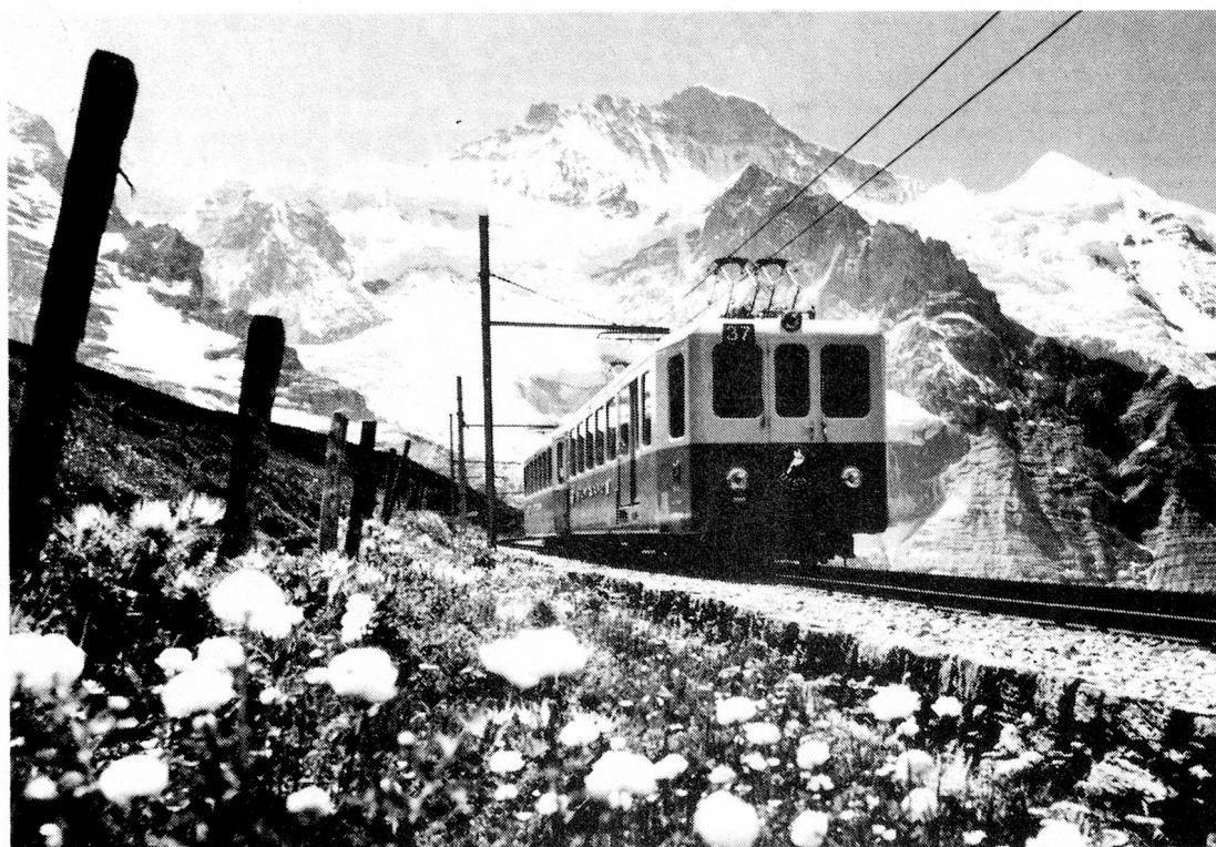
A train of the Jungfrau Railway with the snow-capped Jungfrau mountain in the background.

LET'S join the world's slowest express train on its 290 kilometre journey between the two Swiss alpine tourist centres of Zermatt and St Moritz.