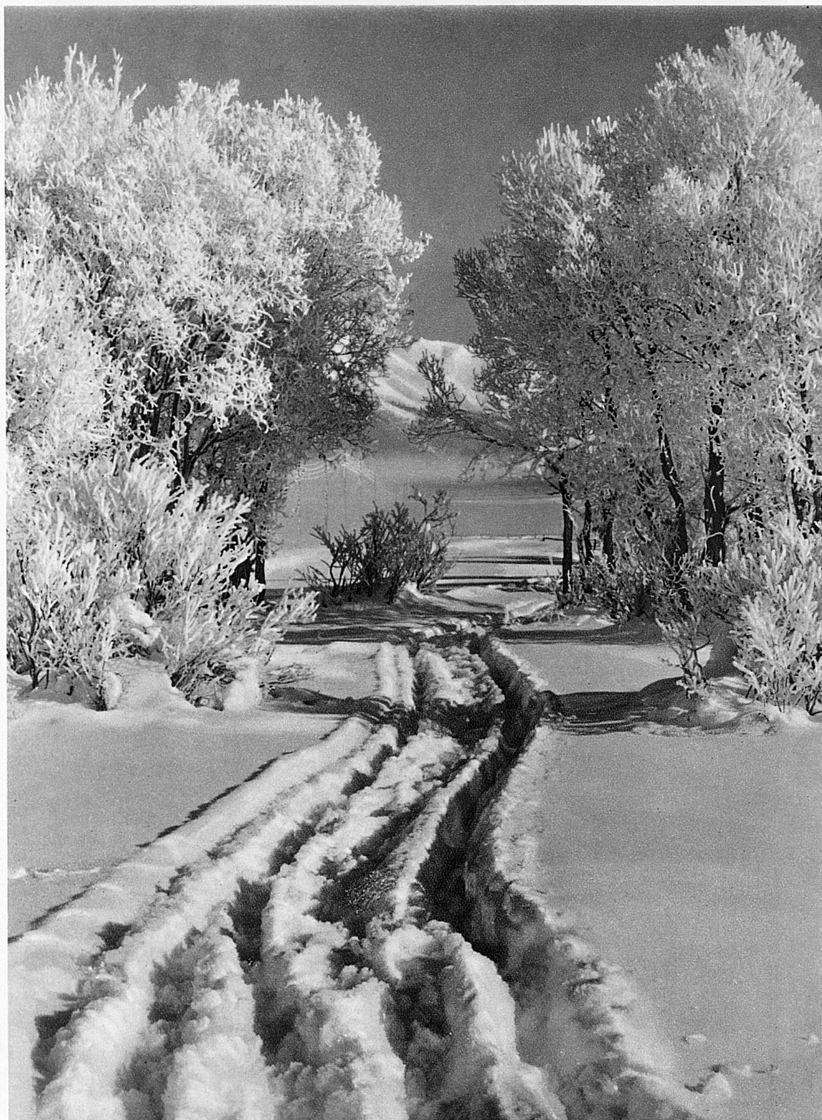
Wintersonne / Soleil d'hiver / Winter Sunshine / Paesaggio invernale