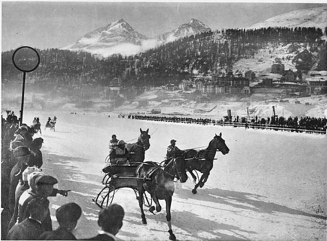
Trabrennen / Les courses sur la glace / Races on the Ice / Corse sul ghiaccio