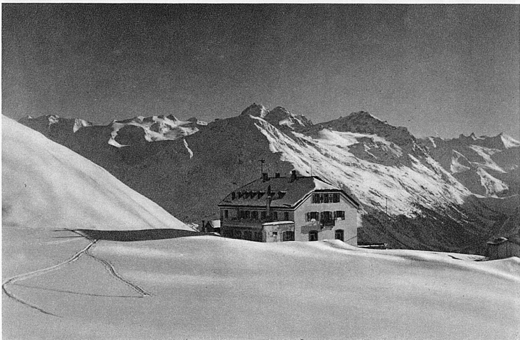
Auf sonniger Höhe / Sur nos monts quand le soleil... / Sunshine and Snow / Sole e neve