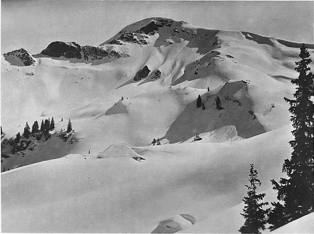
Grimmialp & Raufihorn