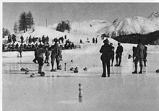
Eisspiele / Les jeux sur la glace / Ice Hockey and Curling / Giochi sul ghiaccio