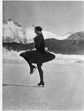
Kunstlaufen auf dem Eise / As du patin / Fancy Skating / Virtuosismo sul ghiaccio