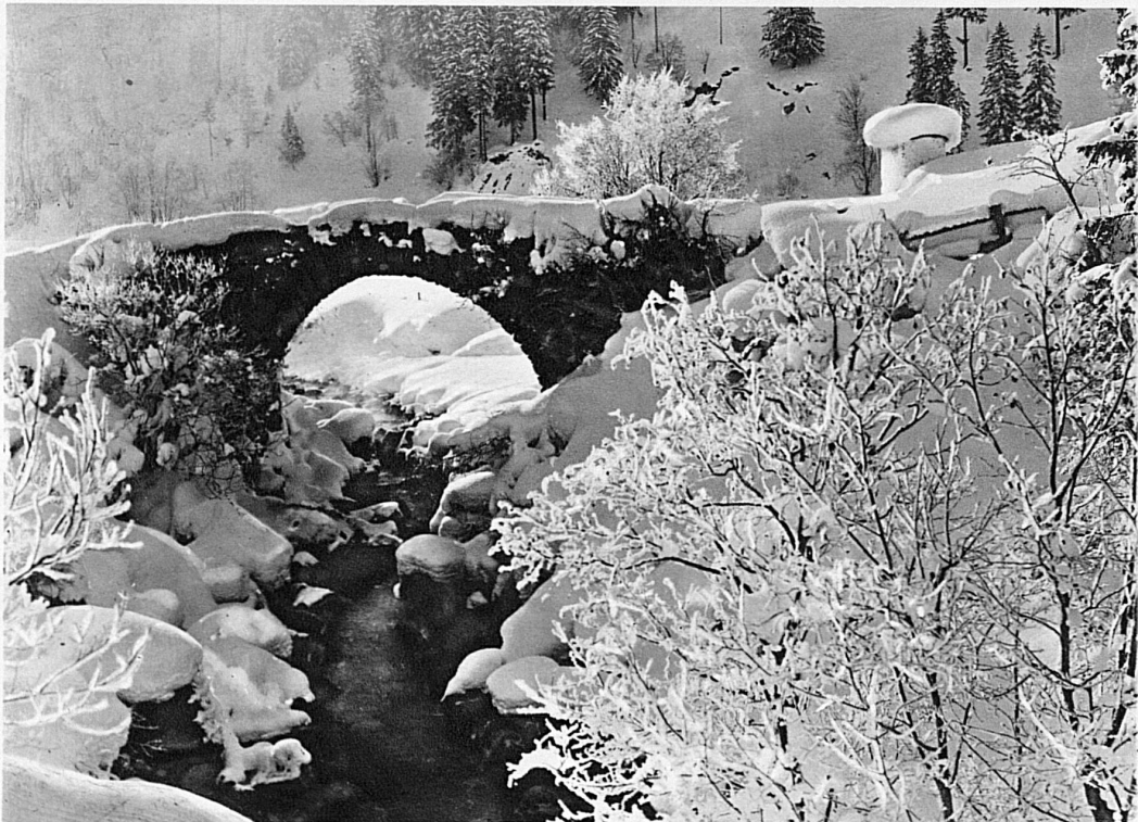
Stiller Winkel / Solitude! / A quiet Nook / Quiete invernale