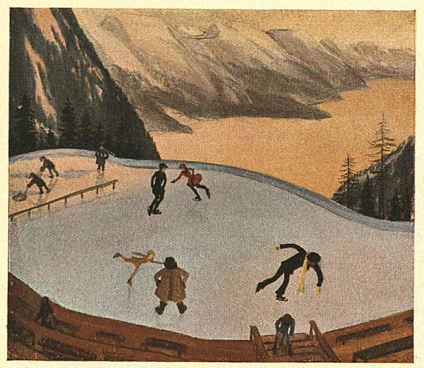
Wherever there is not a lake the town or the hotels construct excellent rinks for their visitors

British Racing Rules and paid the Ski Club of Great Britain the great compliment of asking them to organize next winter the first International Downhill Racing Meeting. This Meeting will open at Mürren on February 19<sup>th</sup>.