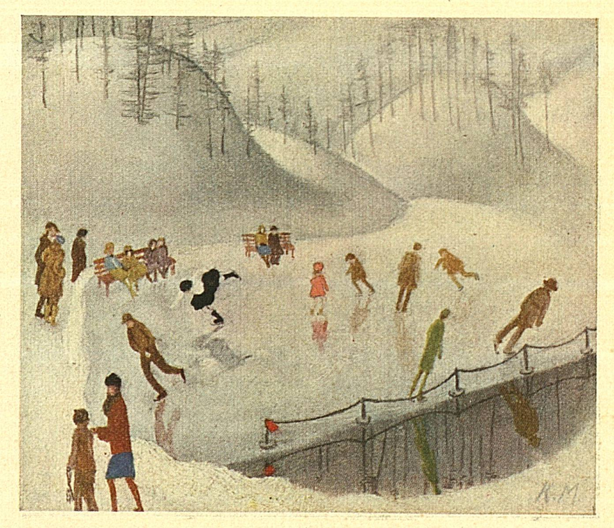
In Switzerland the many lakes form splendid rinks in winter

The Ski Club of Great Britain now numbers over 4000 members. The British have to go abroad to ski. As a result we are hopelessly outnumbered by continental ski-runners, for whereas ski-ing in Switzerland, Germany and Austria is a democratic sport which has been taken up with enthusiasm by all classes, with us ski-ing is a sport for the minority who can afford a winter holiday in Switzerland. Many of our ski-runners only enjoy a fortnight's ski-ing in the year. Consequently they have to work hard and concentrate into that fortnight's ski-ing as rapid an improvement as possible. Among the factors which have contributed to raising the general average of British ski-ing, not the least important are the British ski tests, which have now been