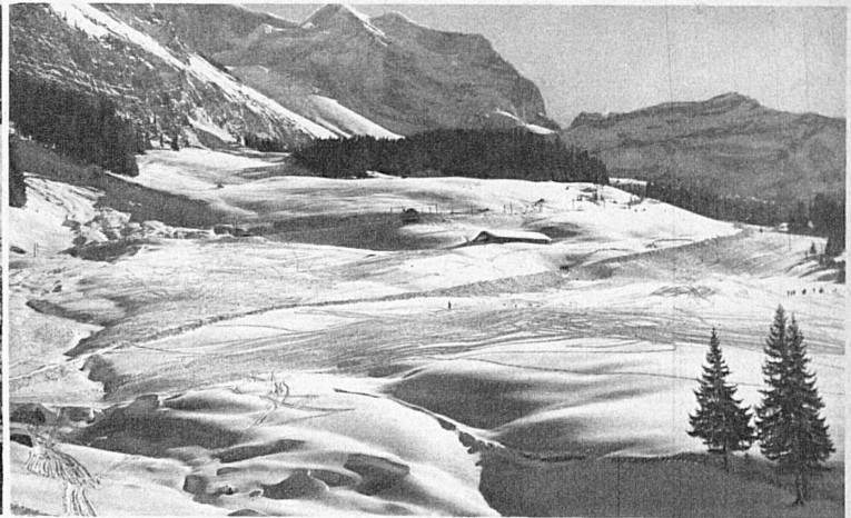
The ski-ing grounds at Wengen — Skifelder bei Wengen