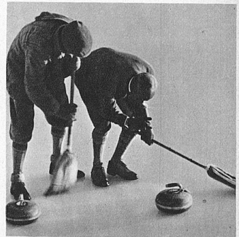
The curling fans — Die passionierten Curler