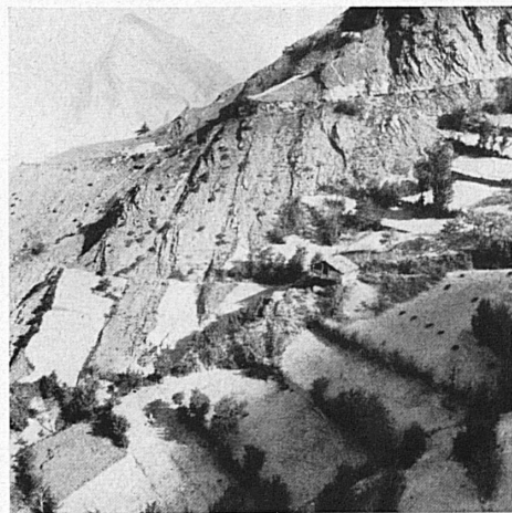
Top: Looking down from the aerial cableway to the slopes of the narrow side-valley, we see the very steepest of the fields clinging to the hillsides. — Oben: Blickt man von der Seilbahn an die Berghänge des schmalen Seitentales, dann sieht man die allersteilsten Äcker an den Hängen kleben.

Top: Somewhat amused, she answered our questions. No, she did not bake the bread herself, that was the baker's job, but she did not know exactly with what he did it—with a little wood or coal, perhaps, or maybe by electricity. The main thing was that one had teeth to eat it with. — Oben: Etwas amüsiert antwortete sie auf unsere Frage - nein, das Brot backe sie nicht selbst, das mache der Bäcker, aber sie wisse nicht genau mit was - mit etwas Holz, mit etwas Kohle vielleicht oder gar elektrisch. Die Hauptsache sei, daß man Zähne habe, um es zu essen.