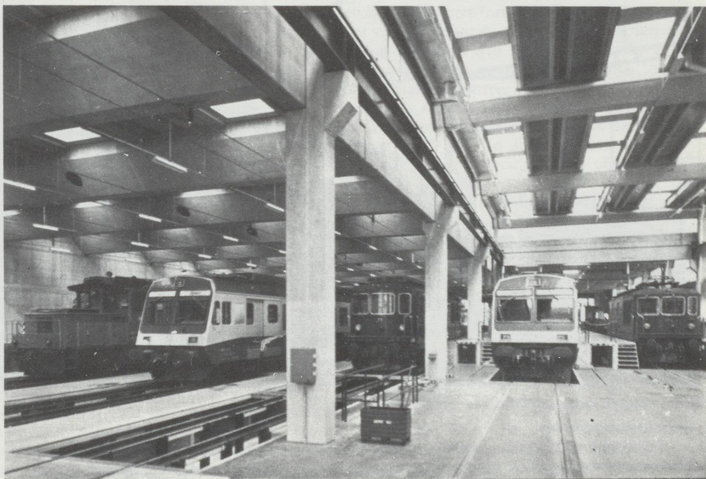
Interior of new depot.

requirements for general servicing, such as compressed air, oil and grease. Located in track 1 is a 22 ton scissors type hydraulic lift to cater for the change of wheelsets from locomotives etc. A locomotive requiring a bogie change has it's body supported on jacks whilst the bogie is disconnected and lowered down into a chamber under the main depot floor. An exchange bogie is then placed onto the lift and raised up under the locomotive. Changeover time is estimated to be 1 hour. The tracks numbered 3 to 6 can be used for the storage of railcar sets. On the street side of the depot is the work area for the electrical department, which is responsible for the maintenance of all overhead power contact systems plus the telecommunications equipment and batteries. There are two extra tracks on the Krattigstrasse side of the depot for the storage of the special vehicles of the electrical department. Over the depot is the electrical control centre which is responsible for the switching of catenary power throughout the BLS system. The old depot building is now used for the maintenance of diesel powered motive power units. Any work required on locomotives etc that cannot be carried out by the depot staff is referred to the workshop. Beside the old depot is the new building for the painting of locomotives, bogies and other large units, it is fitted with complete spray and exhaust equipment.