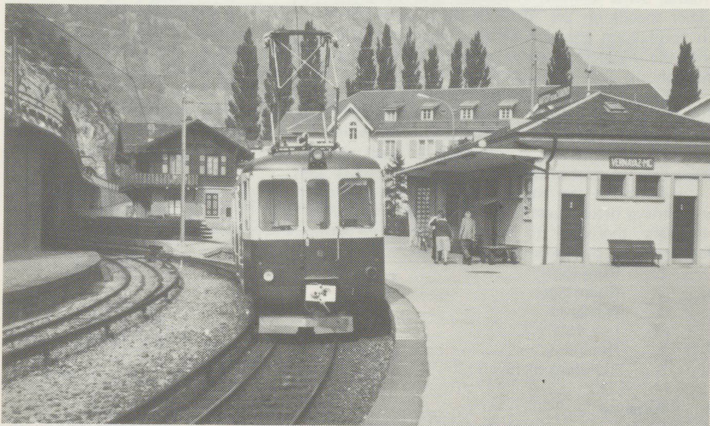
ABDeh4/4 No. 8 at Vernayaz station.

From Finhaut, at a height of 1224 metres, the line runs on a narrow ledge and after passing through several short tunnels, descend to Châtelard-Gietroz at 1126 metres above sea level. This is the site of one of the older power stations and under cover, on the right, one may sometimes see some of the older rolling stock stored. It is also notable for a remarkable funicular about which I might write a note on some other occasion. It is the only one I know of which employs a large block of concrete to prevent the cars from becoming airborne.