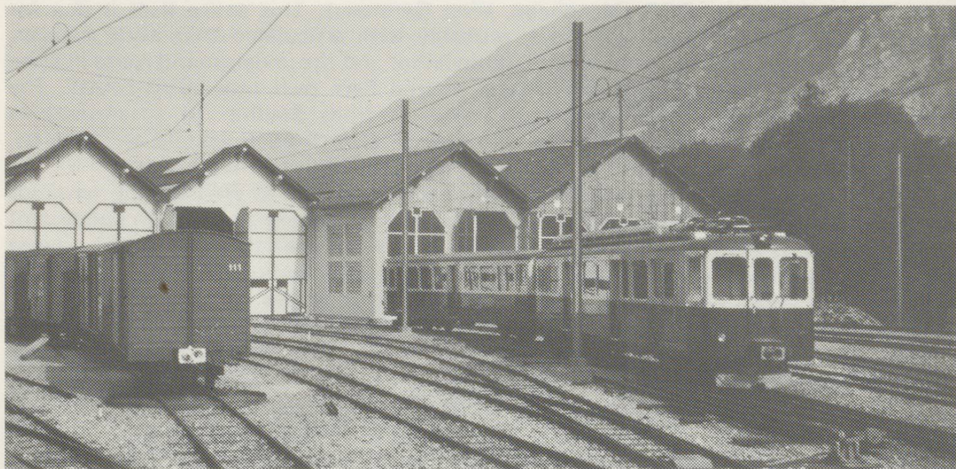
ABDeh4/4. No. 7 and Bt at Vernayaz Workshops

As far as Vernayaz, 3.99 kilometres from Martigny, the railcars on this roadside line draw their 800v DC traction current from the overhead line. At Vernayaz, lies the main depot which houses not only the modern rolling stock but also some splendid specimens dating from the opening of the line which are used on special trains and occasionally on work trains. The yard is electrified on the overhead system but in the small curving station, one has the first sight of the third rail raised much higher above the sleeper level than in Britain. Here, too, the Strubb system begins as the train enters a tunnel and begins to climb sharply.