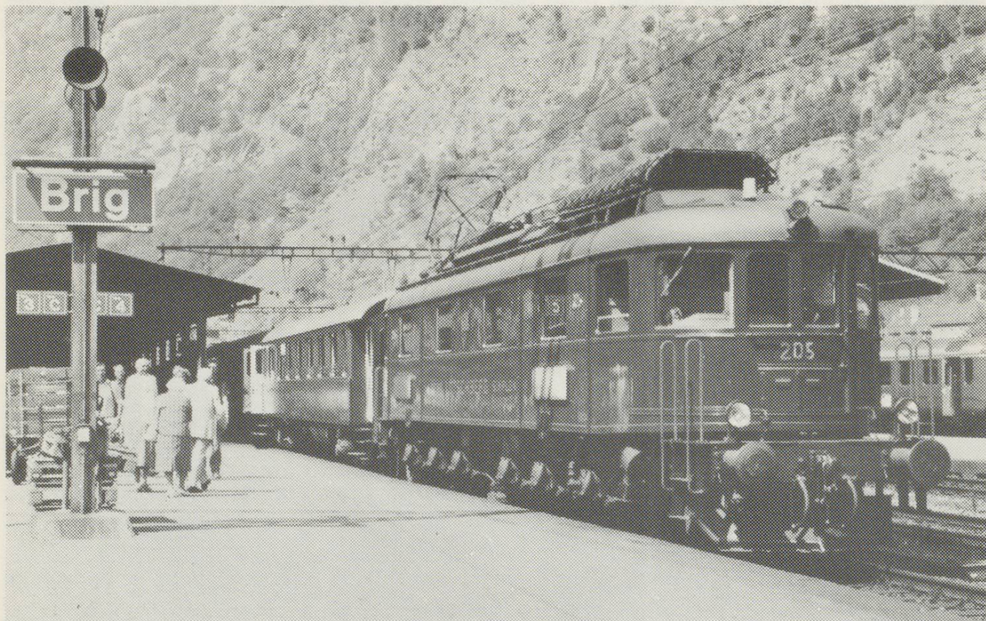
B.L.S. Ae6/8 No. 205 with Historic Coach Train. Brig station. B.L.S. 75 Years.

The next day, in glorious weather, I made my way from Interlaken to Bern to join the special train composed of 1930's stock hauled from Bern to Thun by S.B.B. locomotive Be4/4 No. 12320 in its brown livery. The locomotive trundled at its best speed to Thun where it was replaced by a B.L.S. Ae6/8 No. 205 built in 1939 to a 1926 design, which demonstrated its prowess with a seemingly effortless performance to surmount the north ramp to Kandersteg thence to drift down to Brig. I left the train there to have a look at the B.V.Z. at Visp and to attempt to photograph the train on its return journey to Hohten.