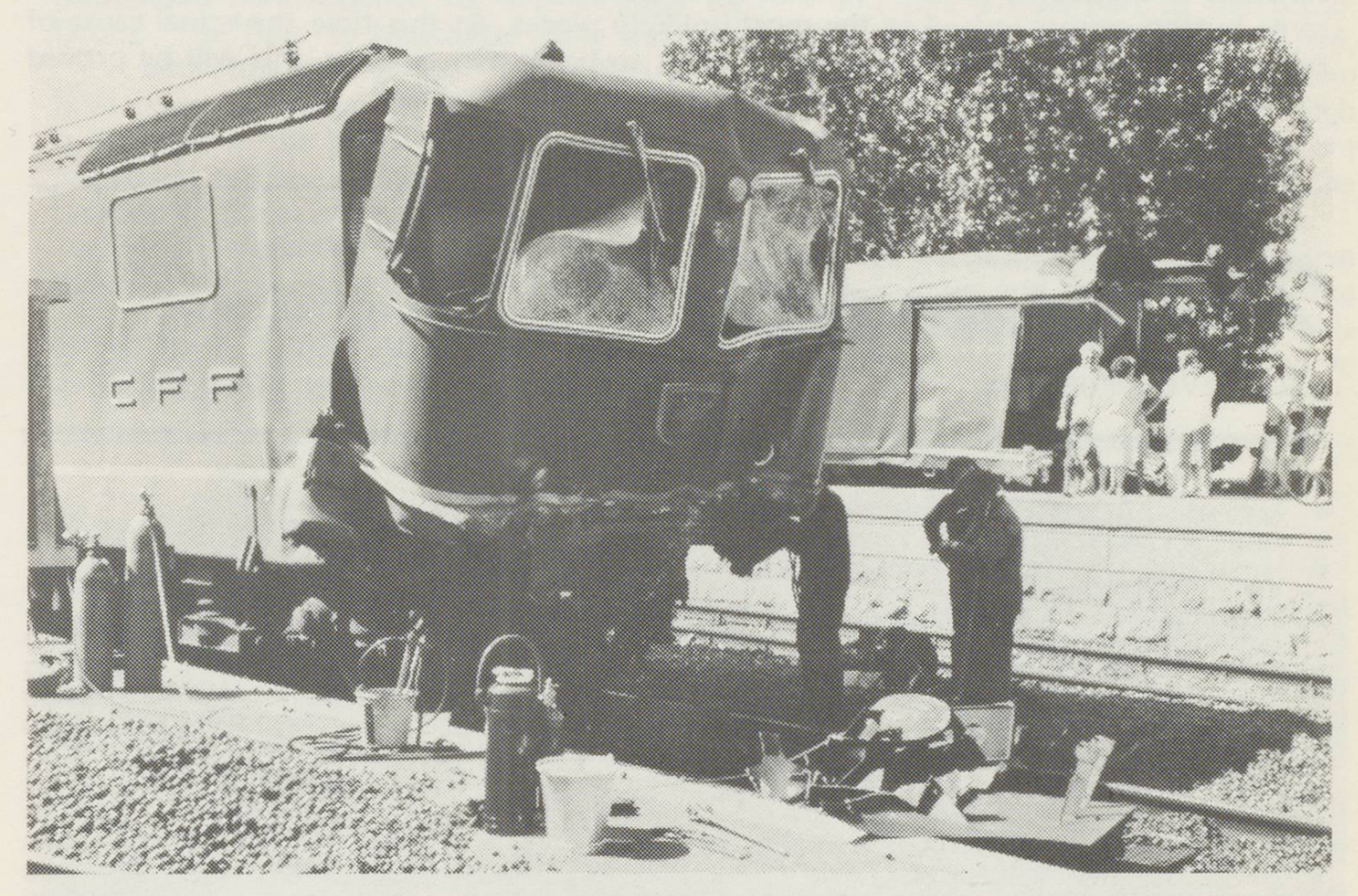
Re4/411 locomotive No. 11343, showing damage to front area.

just behind the Re4/4 was bent double as it was pushed upwards through the front of the platform canopy before coming to rest above the locomotive, the first of the C.F.F. type Bpm coaches was damaged where the baggage coach had crumpled the front area, and the restaurant coach lost its pantograph as the overhead wires were dragged down. The rest of the coaches of the express appeared to be undamaged and remained on the track. Catenary wires through a large part of the station area were brought down. Amazingly, when the rescue teams arrived just minutes later they found that nobody was seriously hurt but about fifty people required treatment for minor injuries and shock. Fortunately the driver of the express escaped injury, as he could be seen walking around inside the locomotive looking for an exit as both doors had been crushed, eventually leaving via one of the side windows.