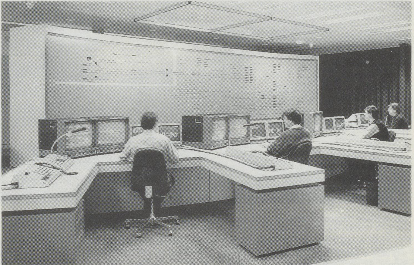
The main signal control room at Luzern.

The station in Luzern is the terminus for traffic from the Gotthard, Basel, Zürich and Bern on the standard-gauge lines and the Brünig/Engelberg metre-gauge line. The current building still under construction is part of a ten year programme to replace the old station which was severely damaged by fire on the 5. February 1971. The first signal control was commissioned in 1898 using the Bruchsal 'G' mechanical interlocking system, which linked one main and four shunting signal boxes in the immediate area. From 1935 work began on the replacement of the semaphore signal unit by multi aspect colour light signals, followed in 1950 by the replacement of the mechanical route release system by an electrical system. From 1963 the point rod and wire systems were being replaced by electrical equipment, and in 1969 the junction of Gütsch was built and the tracks linking it to the main station made bi-directional. 1981 saw the start of the rebuilding work for both the main station and the new signal centre, located on the south side of the station, to control the 112 main routes and 362 shunting routes in the Luzern area. The centre became fully operational on 24. April 1988.