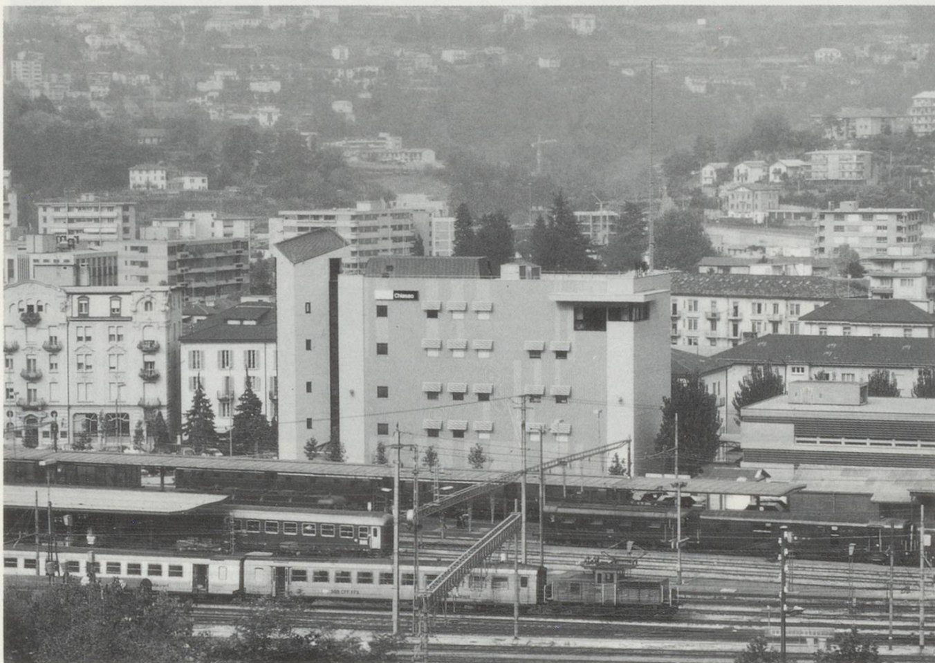
Chiasso Station and the new signal centre.

April 1989 saw another milestone in the modernisation of the Gotthard line of the Swiss Federal Railways, when the first fully computerised signalling system was commissioned. The new system was built and installed by Siemens Albis, to replace the 5 electro mechanical systems that had been working in this area since 1929. The core of the signal control system is the Siemens SIMIS-C micro computer - a miniaturised version of the SIMIS Control system - of which there are 69 controlling the 172 point motors, 303 track circuits, 377 signals, the SFR block system, the FS block system and two catenary power supplies located in the 100 kilometres of track within the Chiasso control area. This installation was the first full electronically interlocked system designed and built for the SFR.