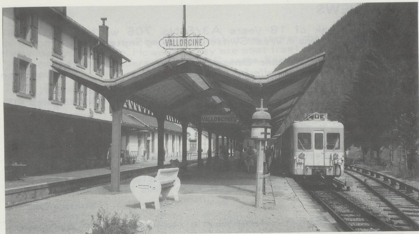
Vallorcine station, the upper terminus of the Martigny-Chatelard, with SNCF automotrice at right.