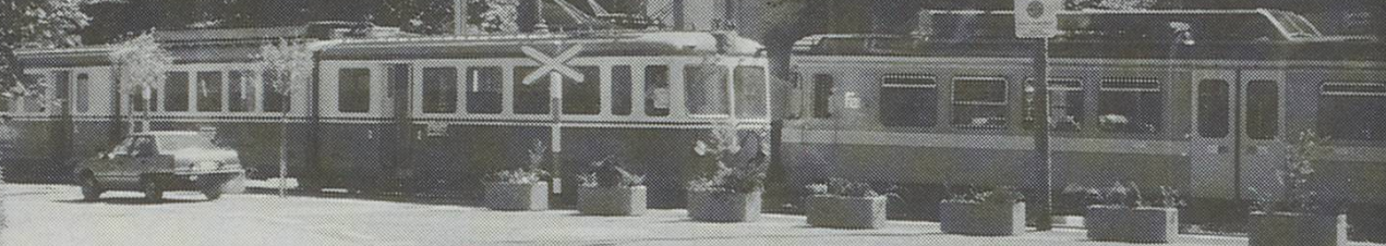
Centovalli ABeB/B and FART SIG built Be4/B at Ponte Brolla, 23.8.88

engineering work between there and Interlaken Ost., which had the rather nice touch that the driver dropped us off in Goldswil, about a hundred yards from our apartment, and saved us the walk uphill from Ost.