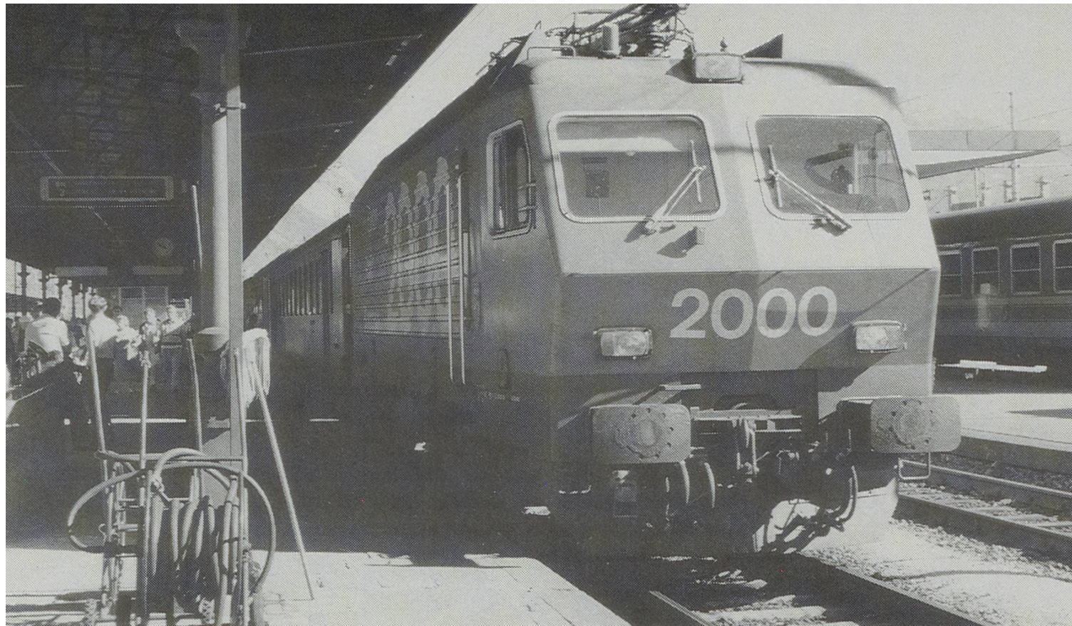
Re4/4 V in Bahn 2000 livery at Dommosodola, at the head of the Geneva - Milan express, with Bern - Ventimiglia portion, 09.55 23.8.88.

through service to Luzern and Basel. We then had a memorable ride, looking out for all the spirals and loops en-route and enjoying the route's very spectacular scenery and engineering. At Bellinzona we passed an express of MkIV stock with a MkIII restaurant car, we also passed a couple of freights, one a Hupack.