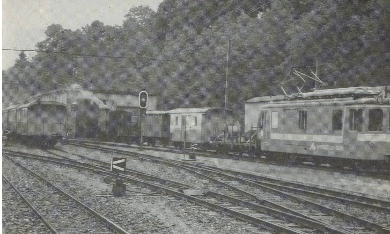
The Appenzellerbahn shed at Herisau, 2.6.90. Del/4 No.50 with ex-RhB G3/4 raising steam.