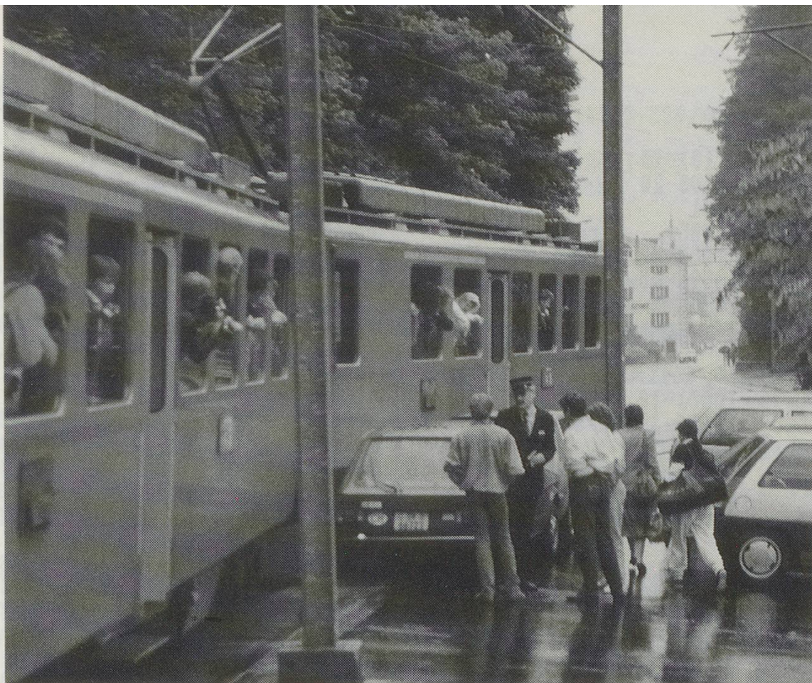
Contretemps near la Presse, 4.6.90. The Chur bound Bernina Express has just side-swiped two cars parked too close to the line.