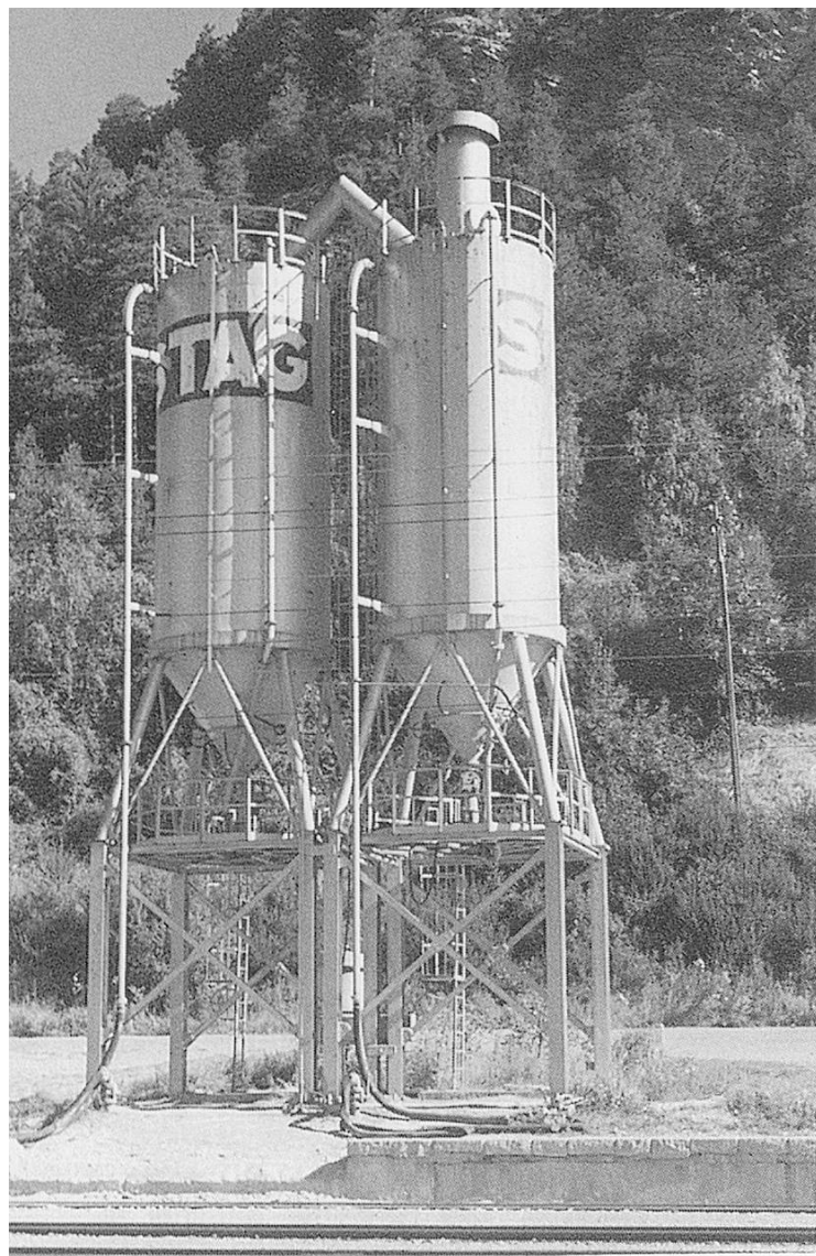
Cement silos at Tiefencastel in September 1978

and spot some lorries in strategic places alongside the sidings on one of our stations.