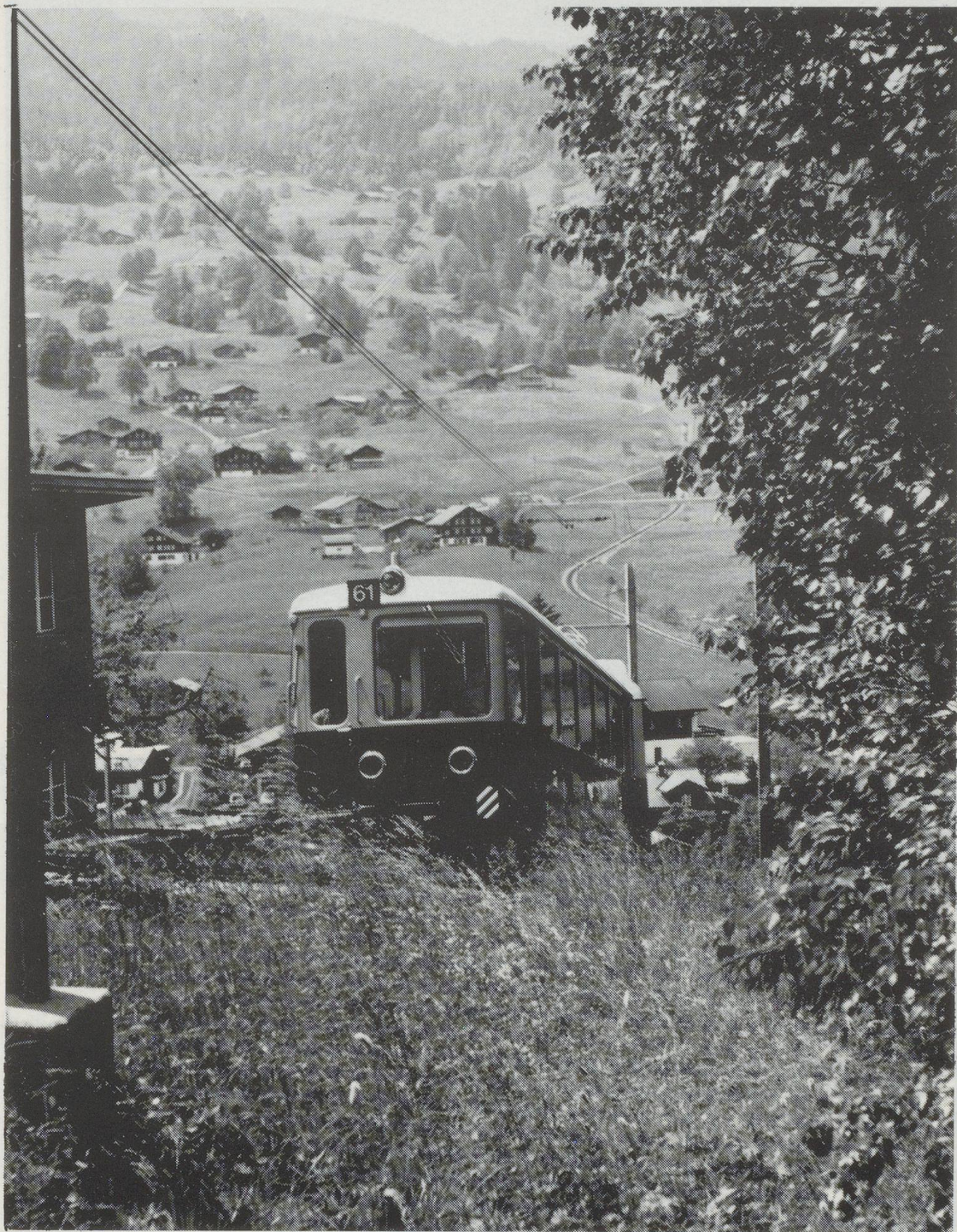
Grindelwald-Grund train of the WAB on 9 June 1988.