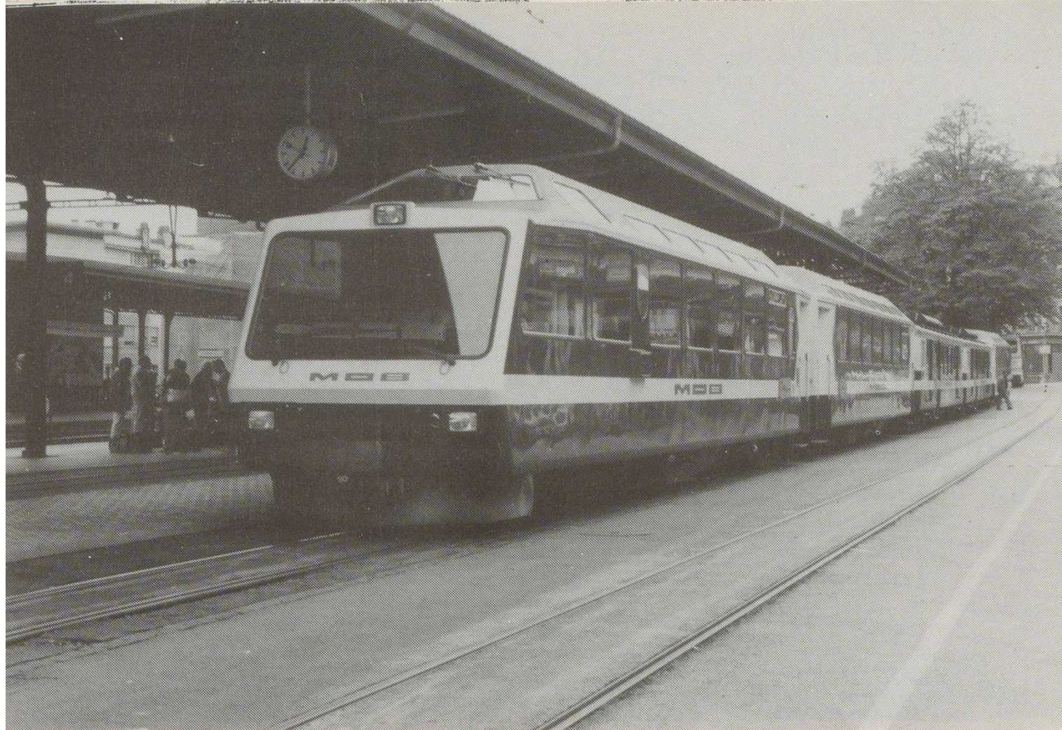
Above: Superpanoramica Express at Montreux, with railcars 3006 and 3006 in the centre