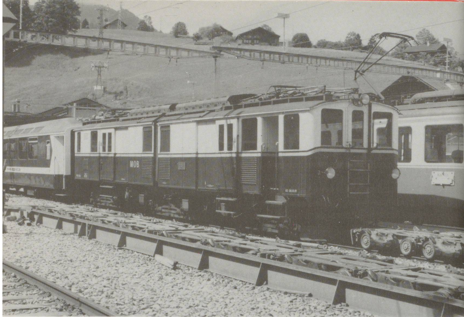
DZe 6/6 No.2002 shunts a Panoramic Express coach at Zweisimmen

The coaches, with their broad windows and roof lights, provide superb views of the passing scenery. Don't miss a trip to the bar car to sample some local wine or buy a postcard or two.