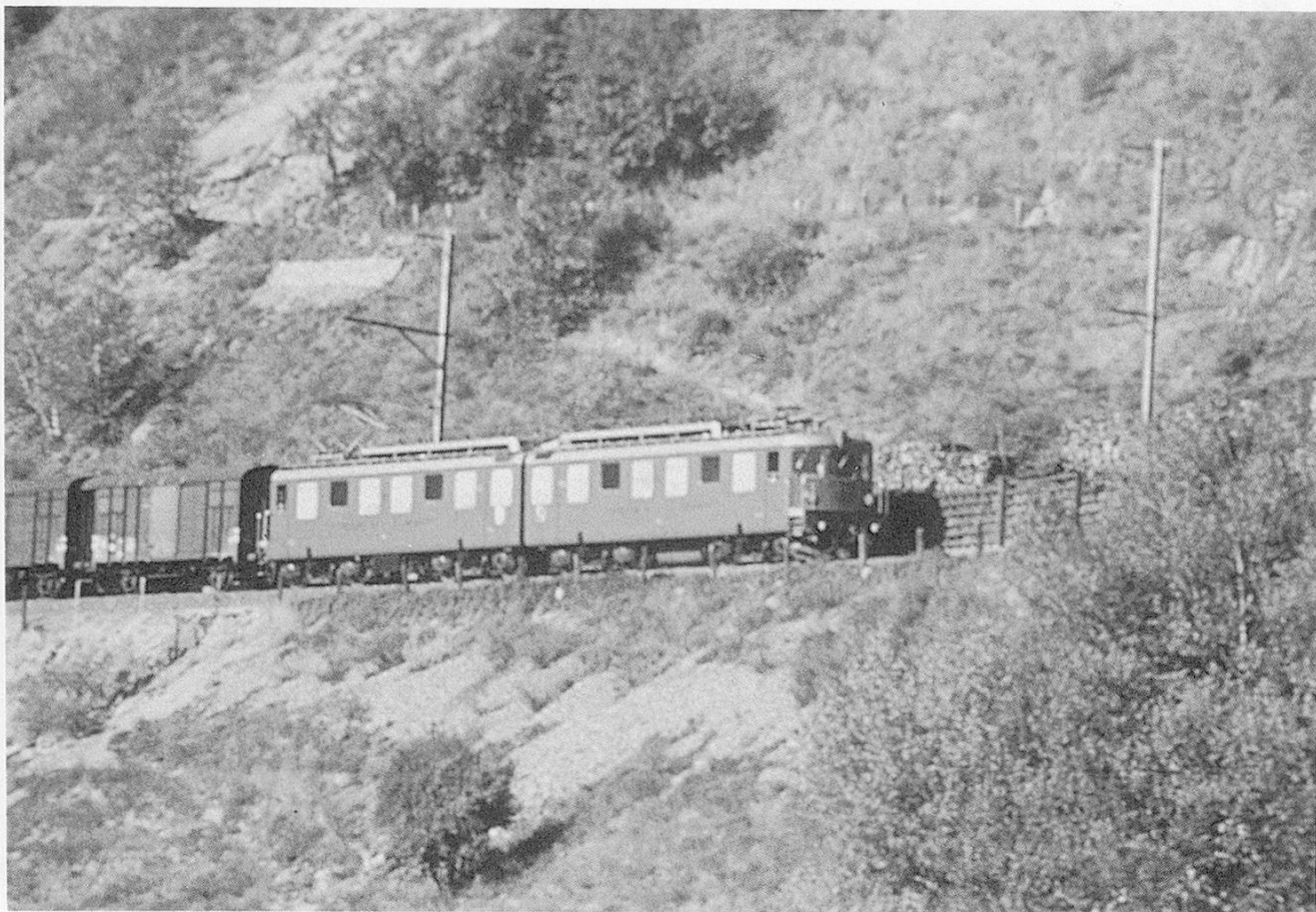
BLS Ae8/8 on the last stage of the journey to Brig

the bore to full dimensions would be a simpler task than cutting a completely new tunnel, hence the fixed price in the contract.