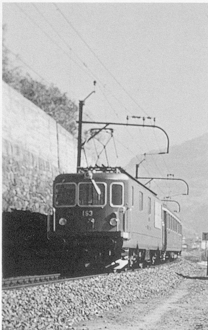
BLS 163 heads an express out of Brig towards the Lötschberg.

To try to make conditions less exhausting at the working face, more powerful ventilating plant was installed, but proved inadequate. It was only by bringing in icy water, drawn from a mountain stream, and spraying it in the tunnel near the working face to cool the incoming fresh air, that conditions could be made tolerable.