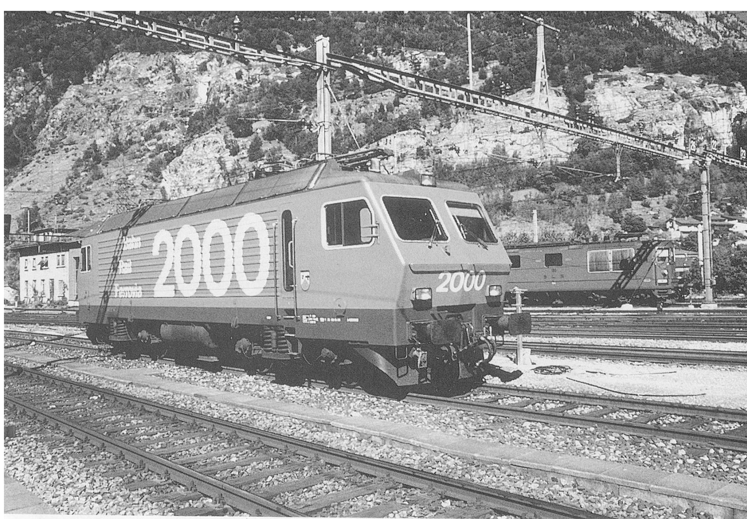
Re4/4 IV 10101 Vallée de Joux awaits its next duty at Brig