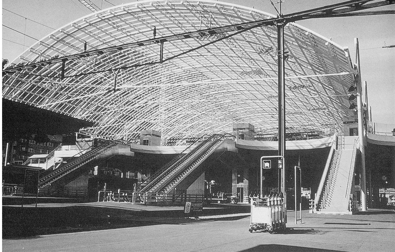
The new postbus station at Chur, taken from the RhB platform (Gleis 7, 8 & 9), 16 May 1993.