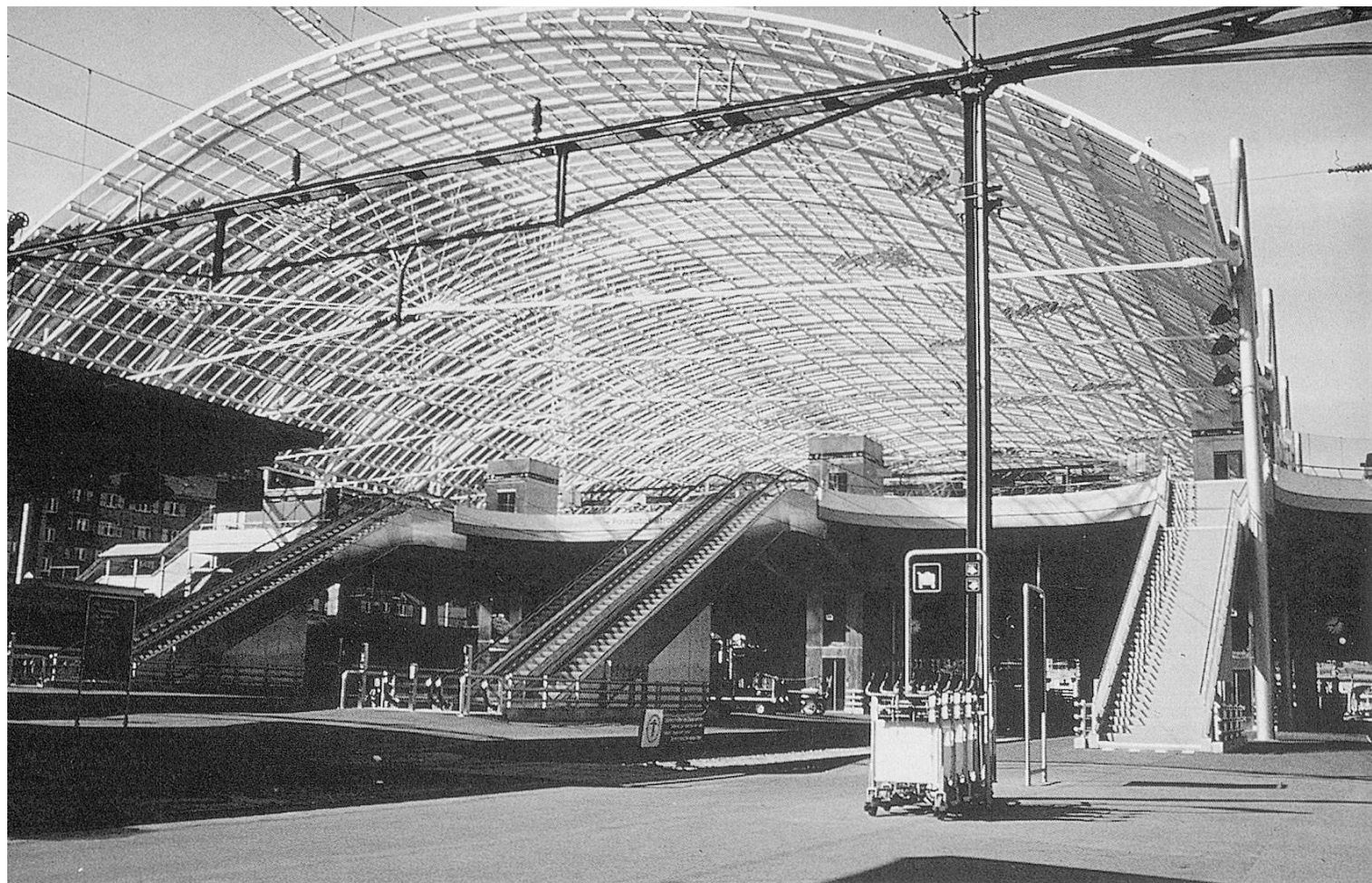
The new postbus station at Chur, taken from the RhB platform (Gleis 7, 8 & 9), 16 May 1993.