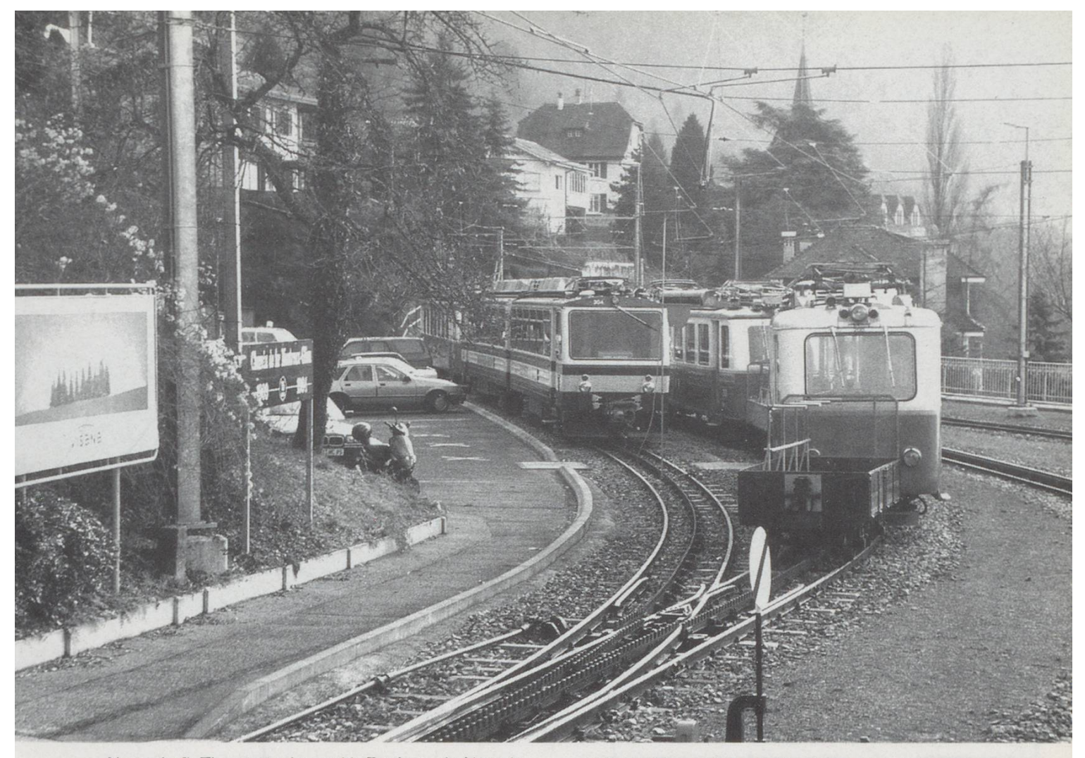
Above Left: The steam loco with Rochers de Naye in the background.

Above Glion, if one knows where to look at the left, one can see the CEV line to Les Pléiades and the MOB metre line near Les Avants - but it helps if there are trains!