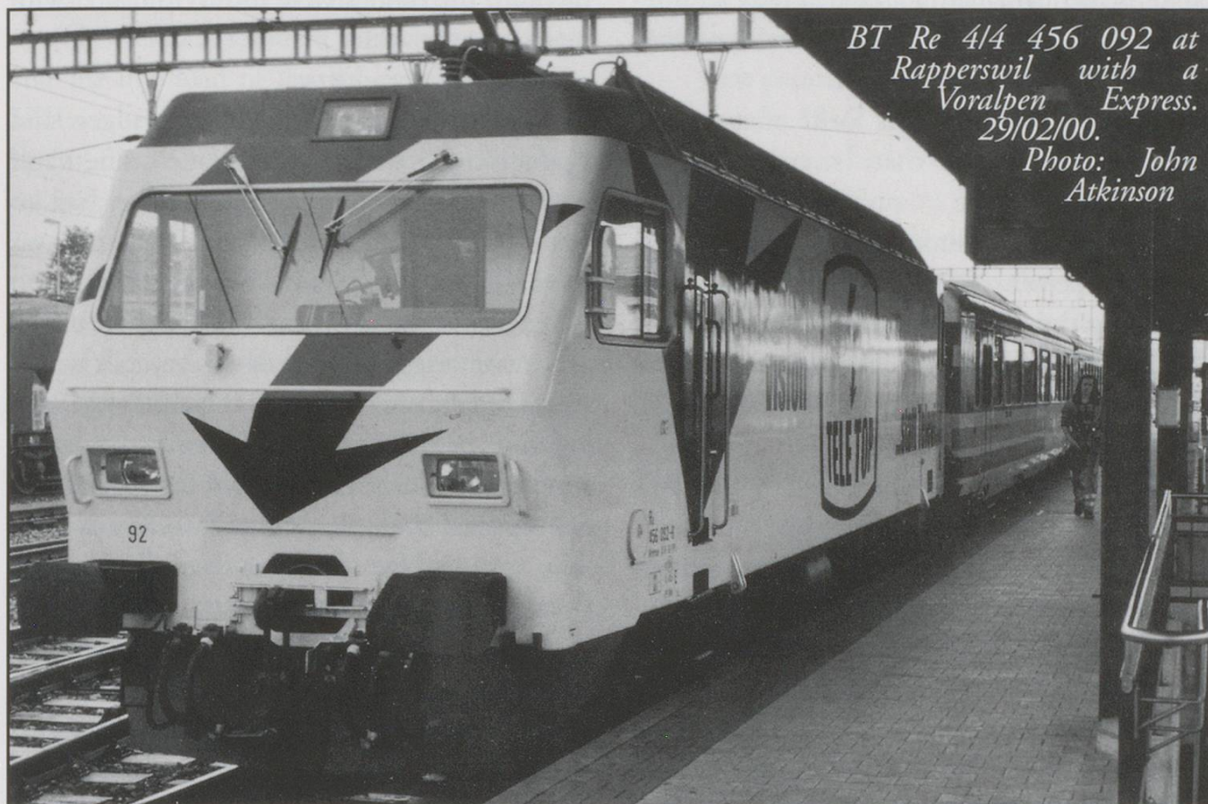
BT Re 4/4 456 092 at Rapperswil with a Voralpen Express. 29/02/00.