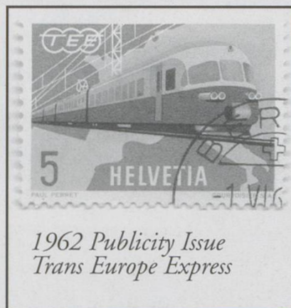
1962 Publicity Issue Trans Europe Express

Transport subjects have appeared on Commemorative issues starting with 100 years of Swiss railways in 1947 depicting steam and electric locomotives of the era. The centenary of the federal post in 1949 produced stamps showing postcoaches and postbuses. A 1962 Publicity issue has the classic TEE unit and the 50th anniversary of the Lötschbergbahn was covered in 1963.