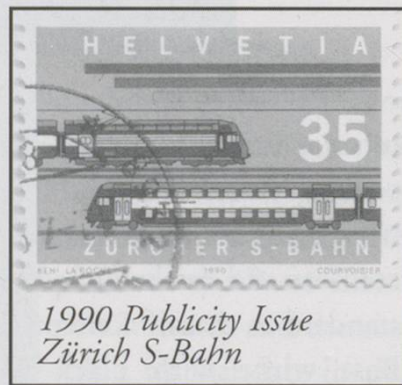
1990 Publicity Issue Zürich S-Bahn

Subjects have also included Zürich trams and S-Bahn, 100 years of the RhB and, of course, the 150 year celebrations of 1997 which depicted trains over the years with passengers in period dress.