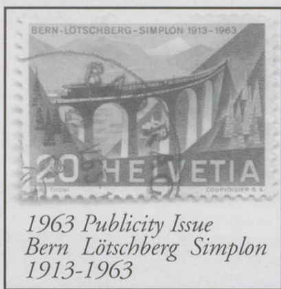
1963 Publicity Issue Bern Lötschberg Simplon 1913-1963

Definitives are the standard designs which exist for a number of years rather like our basic Queen's Head stamps. The earliest national issues date from 1850 and the main themes of the early years are views of Helvetia in various classical poses.