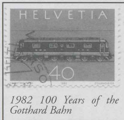
1982 100 Years of the Gotthard Bahn

In addition there have been air-mail series, stamps issued for use by soldiers on active service, and stamps given to charitable institutions and hospitals. Beyond that there are issues by United Nations and other Swiss based organisations. Special issues for use by mobile post offices in the 40s and 50s show postbuses of the era.