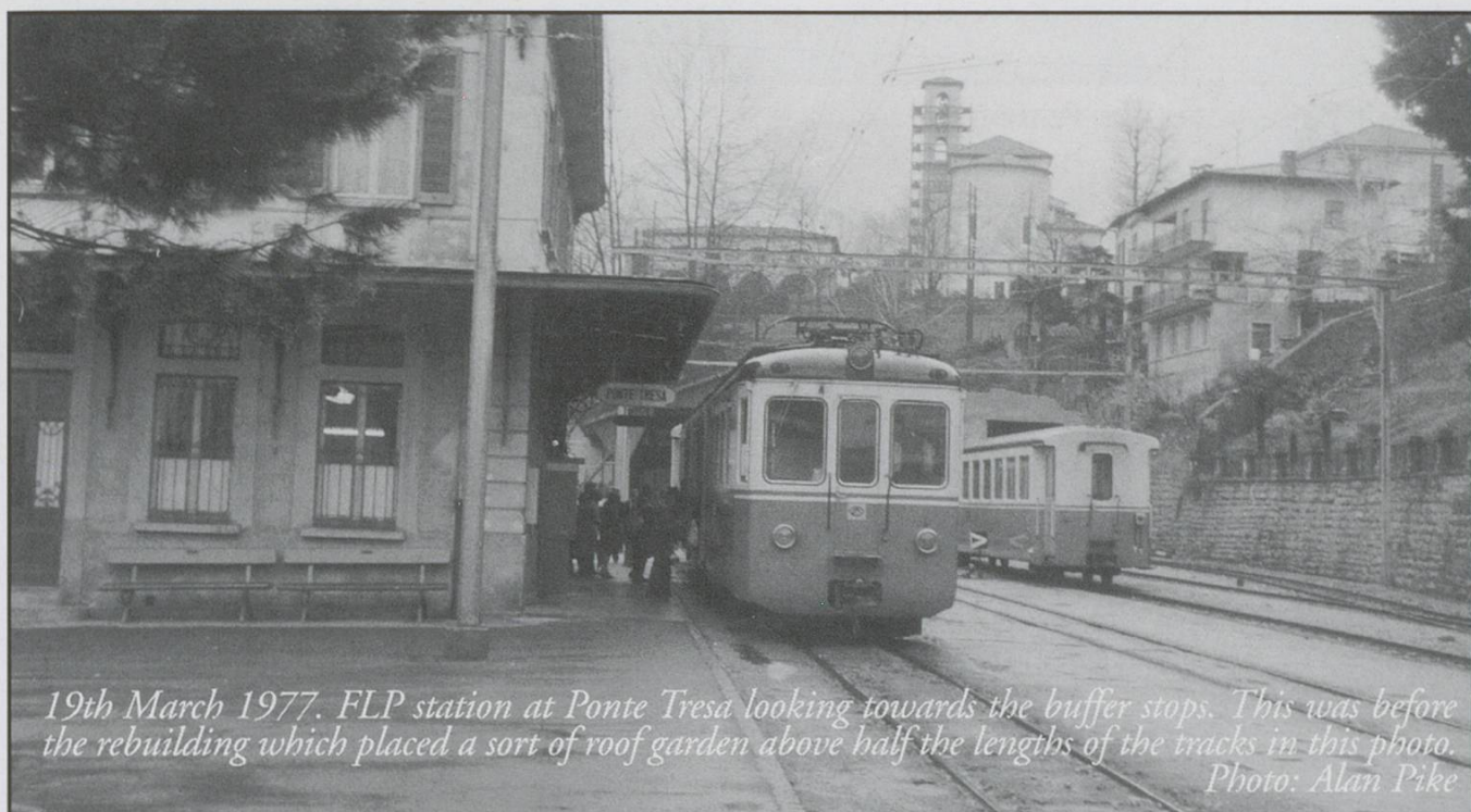
19th March 1977. FLP station at Ponte Tresa looking towards the buffer stops. This was before the rebuilding which placed a sort of roof garden above half the lengths of the tracks in this photo.

Luino (Railway Station). The pier adjoins the waiting room (Lunch 2 1/2 Fr, Dinner 4 1/2 Fr incl. wine) of the steam tramway to Ponte Tresa (Lugano). To the left, passing a statue of Garibaldi and following the broad 'Via Principe de Napoli', we reach the (12 min) Stazione