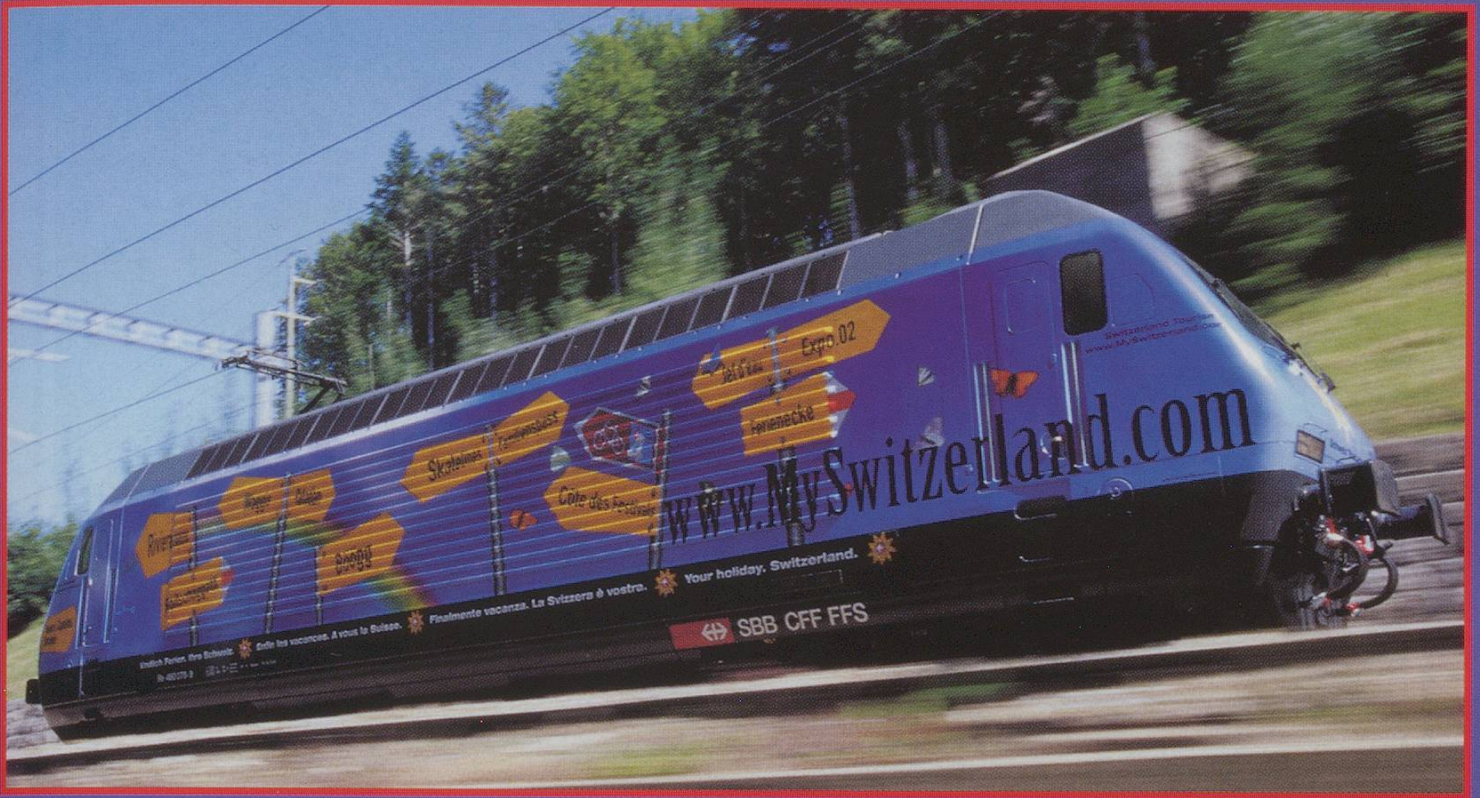
ABOVE: SBB Re 460 078-9 in the livery of Switzerland Tourism. BELOW: SBB Re 460 017-7 in Märklin livery travelling along the Lötschberg near Luden in August 2000. A picture giving a perfect image of the operating terrain.