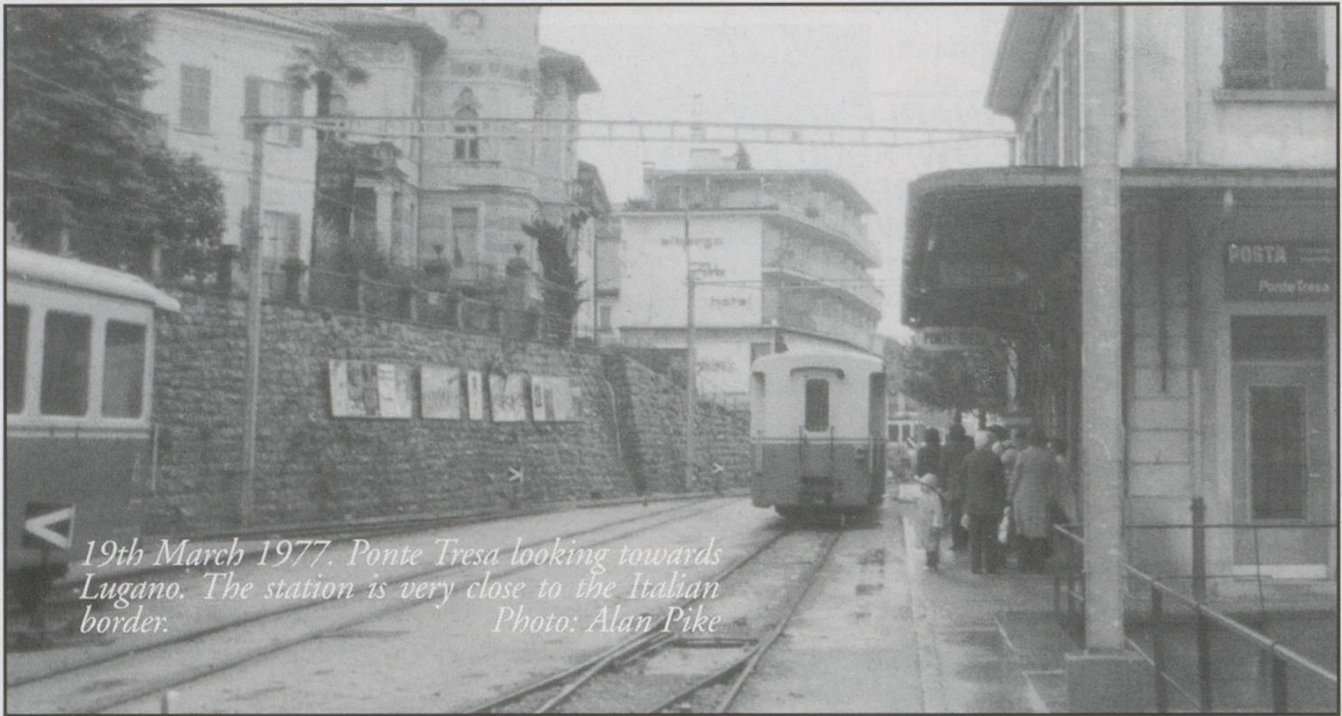
19th March 1977. Ponte Tresa looking towards Lugano. The station is very close to the Italian border.

Lunch 2 1/2 Fr, Dinner 4Fr, Pension 6-9 Fr. These three near the pier: Hotel Metropole, Room from 1 1/2 Fr, Dinner 3 Fr; Albergo Falcone, moderate - - Near the Stazione Internazionale: Milano, Room 2 Fr, Lunch 2 1/2 Fr, Dinner 3 1/2 inc. wine, pension 6-7 Fr. - - Cafe Clerici.