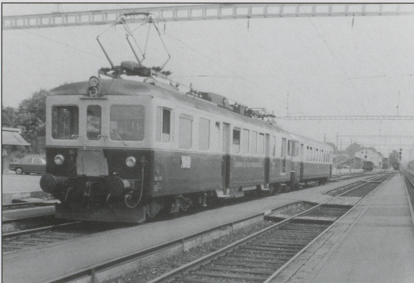
GfM ABDe 4/4 164 at Ins. 6/8/69