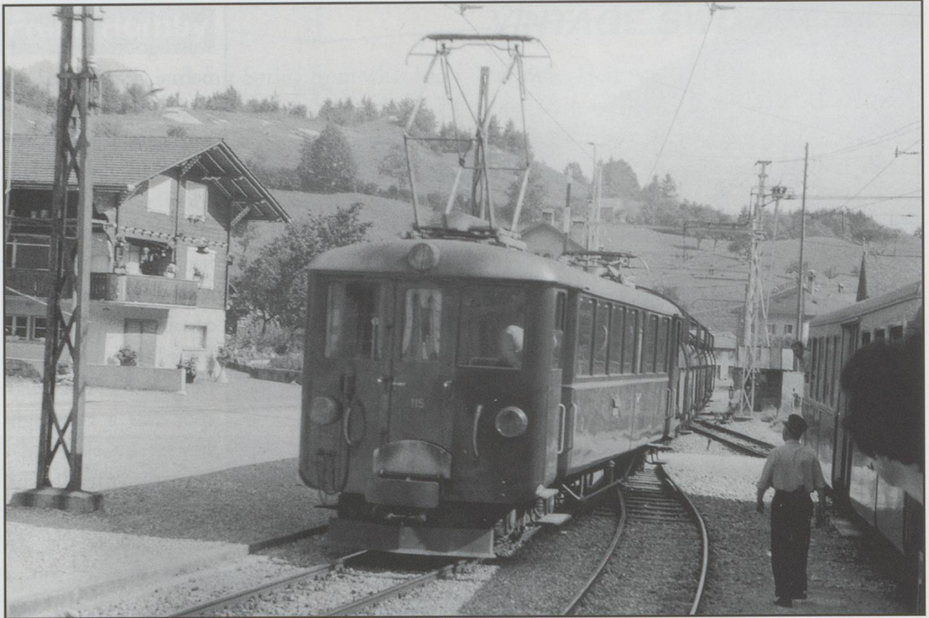
GFM Be4/4 115 at Montbovon - 6/8/69.