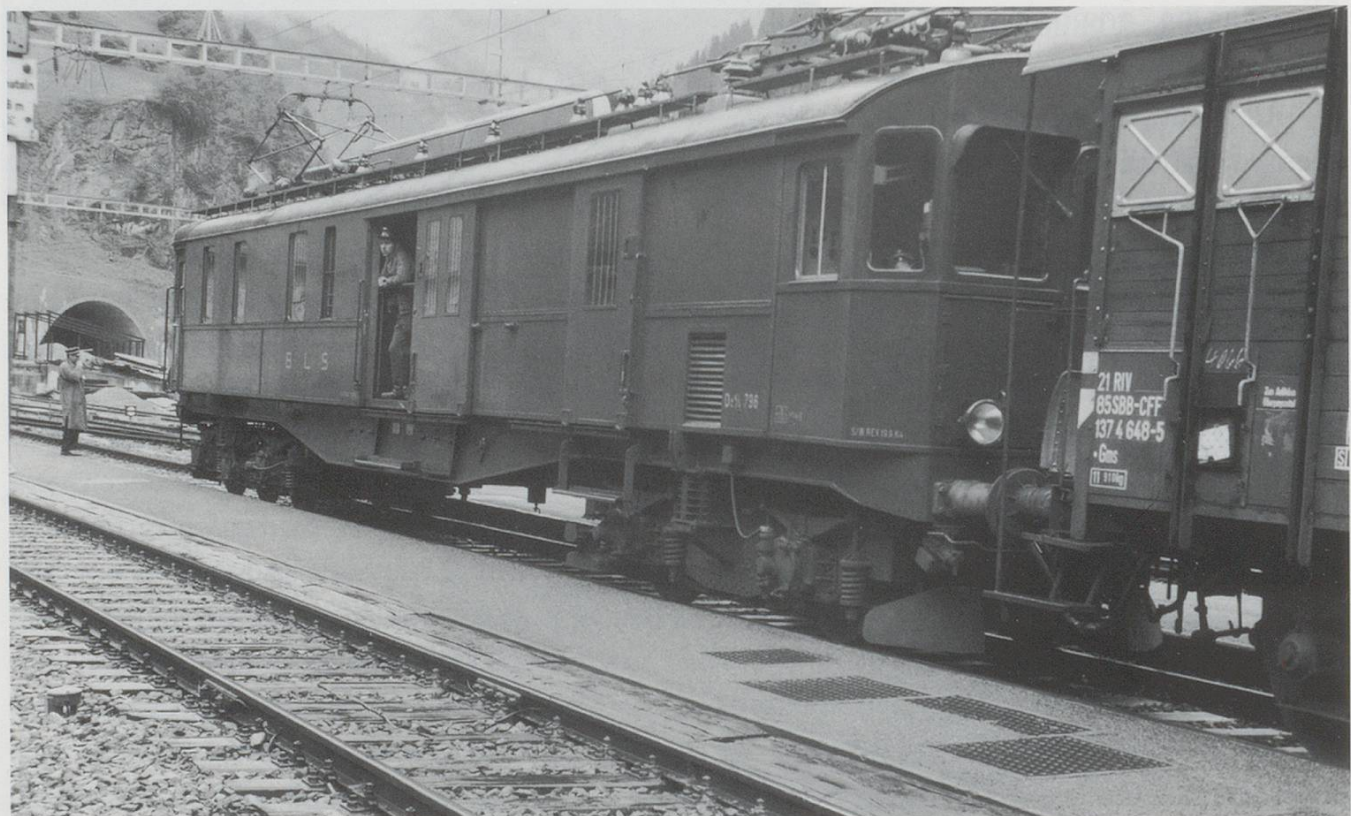
BLS De4/5 796 at Goppenstein. 24/8/67