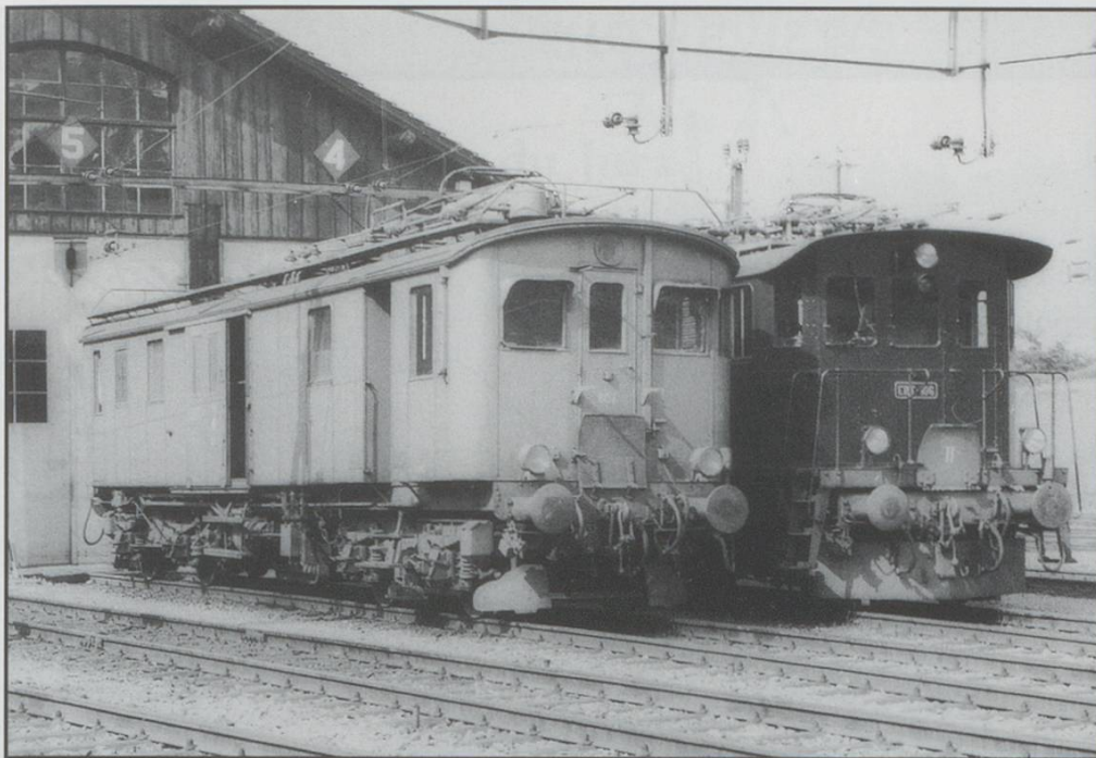
SBB Fe4/4 No. 807 and EBT no. 106 at Luzern Depot. 23/6/59.