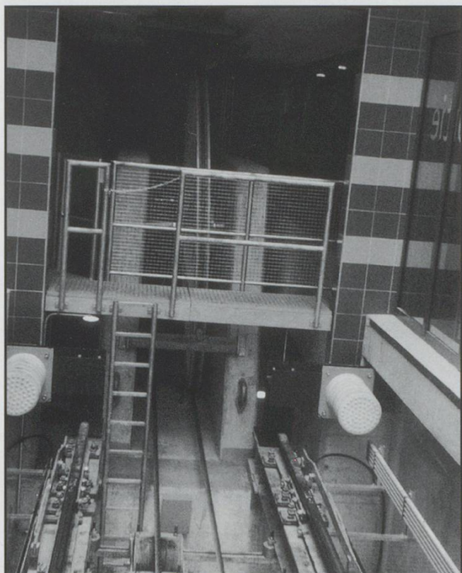
Opening day - lower end - cable wheel, detectors etc.

Just before I left for Switzerland, a good friend told me that a new funicular running from the main station to the Jardin Anglais, near the University and the lakeside, was to be opened on 27 April as part of the celebrations surrounding the completion of renovation which had been in progress for a couple of years. He suggested that I might be able to meet him there after the return of a trip by the official party on an ICN, named that day Jean Piaget , in recognition of a world-renowned neuchâteloise psychologist, to Biel and back.