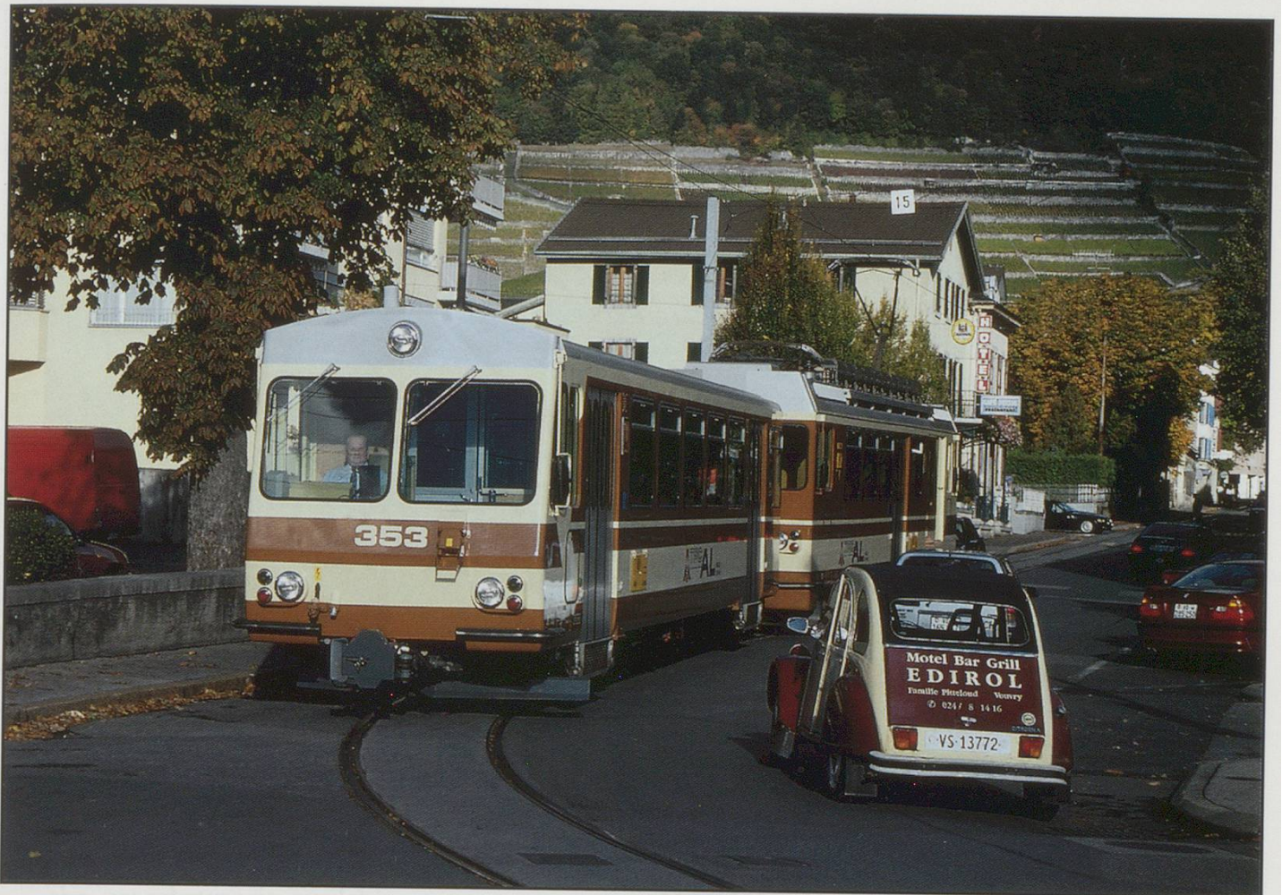
Above: At Aigle on 23/10/1999 an Aigle-Leysin driving trailer 353 leads into the terminus. The “Deux Chevaux” adds to the atmosphere. Below: ASD BDe 401 waits to leave Aigle for Les Diablerets. 23/10/1999.