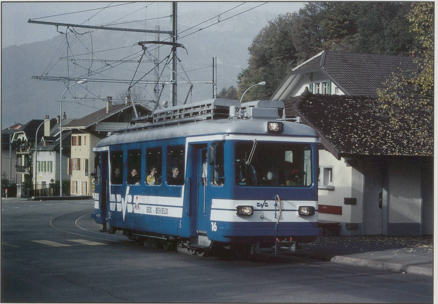
On the next two pages are four pictures by Maurice Portsmouth taken around Bex and Aigle. Above: the BVB's local tram is snapped in Béveaux. 29/10/1999. Below: A BVB train is pictured at Villars. 28/10/1999.