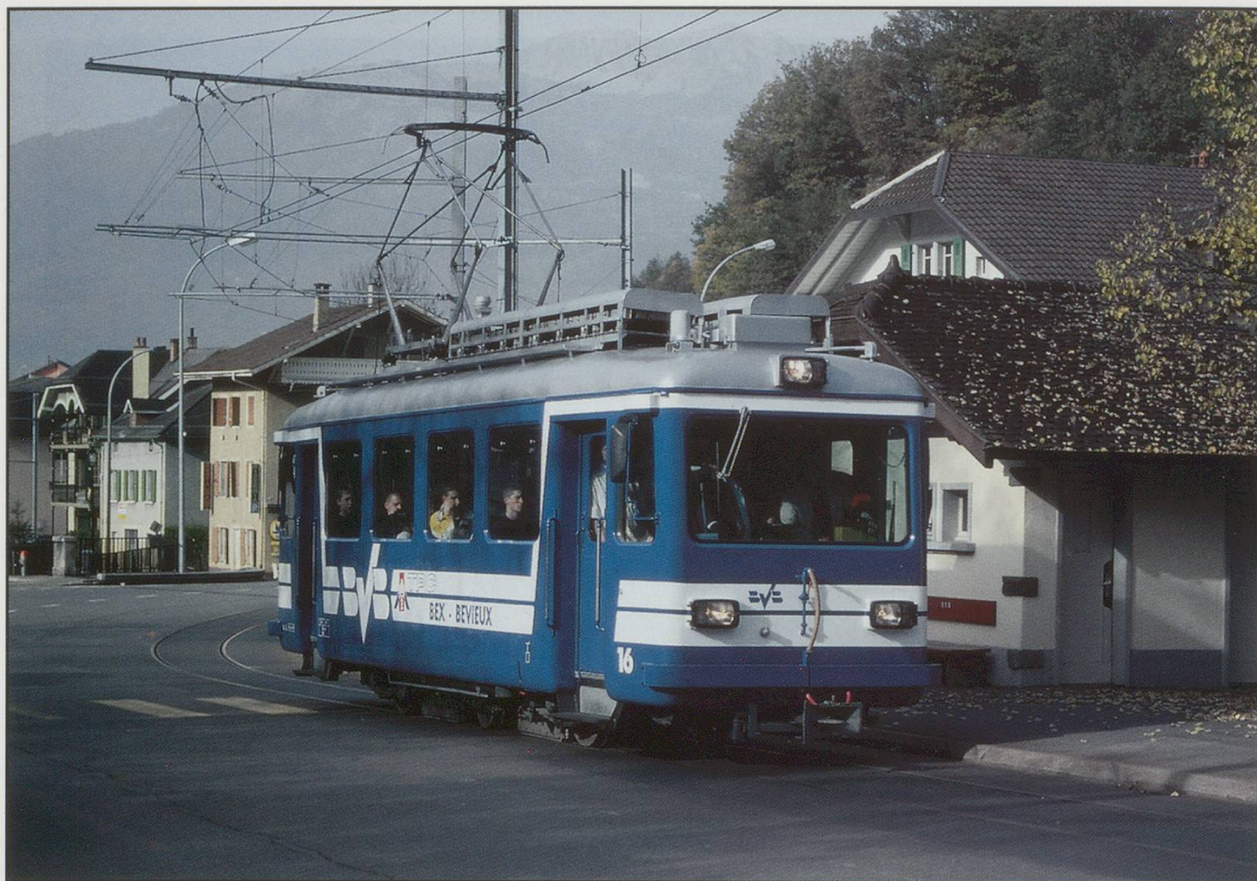
On the next two pages are four pictures by Maurice Portsmouth taken around Bex and Aigle. Above: the BVB's local tram is snapped in Bévioux. 29/10/1999. Below: A BVB train is pictured at Villars. 28/10/1999.