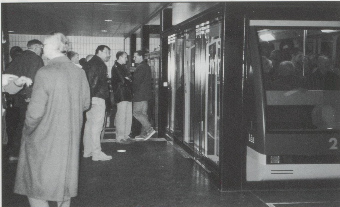
Crowded car No. 2 at Neuchâtel Gare about to leave.

claimed to be unique although I have seen a rather more crude system in use on a short line to a hotel near Karlsruhe.