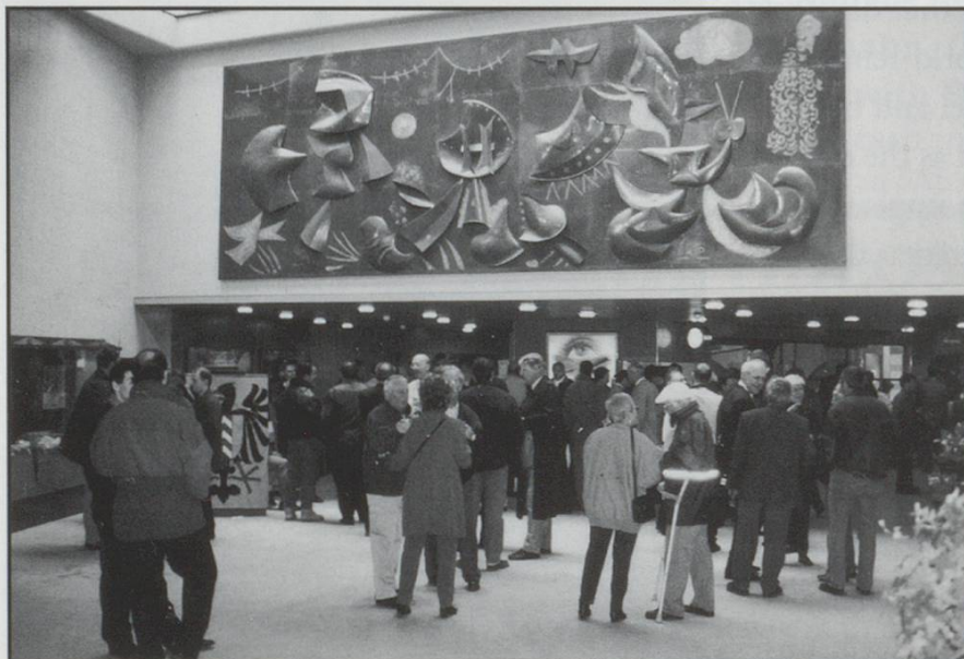
End of opening ceremony at lower station - Jardin Anglais. The haut-relief sculpture is very prominent.

The funicular is the remnant of a much more ambitious scheme part of which would have involved the extension of the tramway from Place Pury to the foot of the funicular although, unsurprisingly, no mention of this was made at the opening. The choice of Neuchâtel for the site of Expo 2002, which will be on the lake, helped the funicular project. It cost SFr 13.5 million of