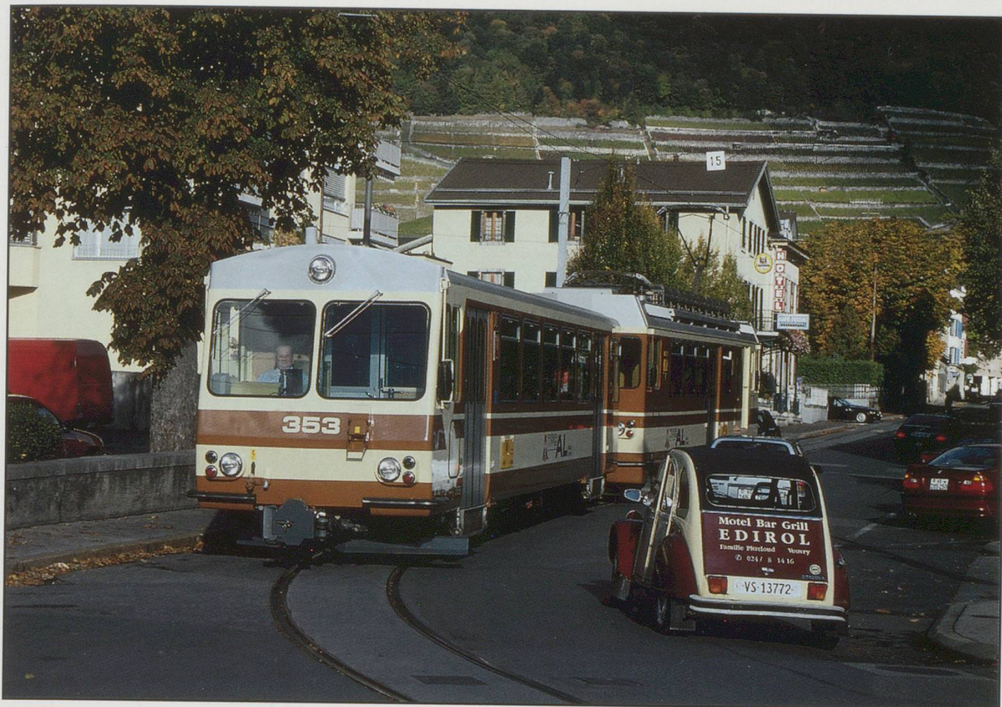
Above: At Aigle on 23/10/1999 an Aigle-Leysin driving trailer 353 leads into the terminus. The “Deux Chevaux” adds to the atmosphere. Below: ASD BDe 401 waits to leave Aigle for Les Diablerets. 23/10/1999.