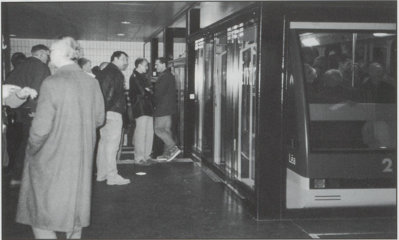
Crowded car No. 2 at Neuchâtel Gare about to leave.

claimed to be unique although I have seen a rather more crude system in use on a short line to a hotel near Karlsruhe.