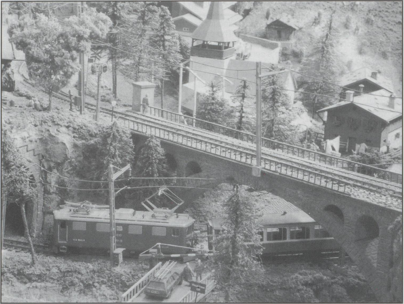
THE VERY LAST TRAIN - Driven by Mike, the oldest loco - 610 'Via Mala' hauling the oldest stock and shown at the bottom of the spiral entering the last tunnel for the last time.